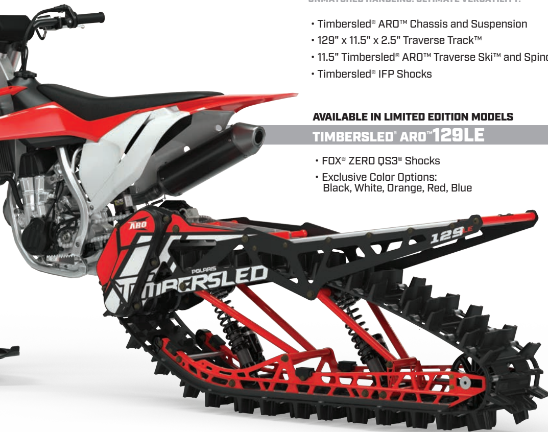
ARO 129 LIMITED EDITION IN RED SNOWCHECK EXCLUSIVE MODEL