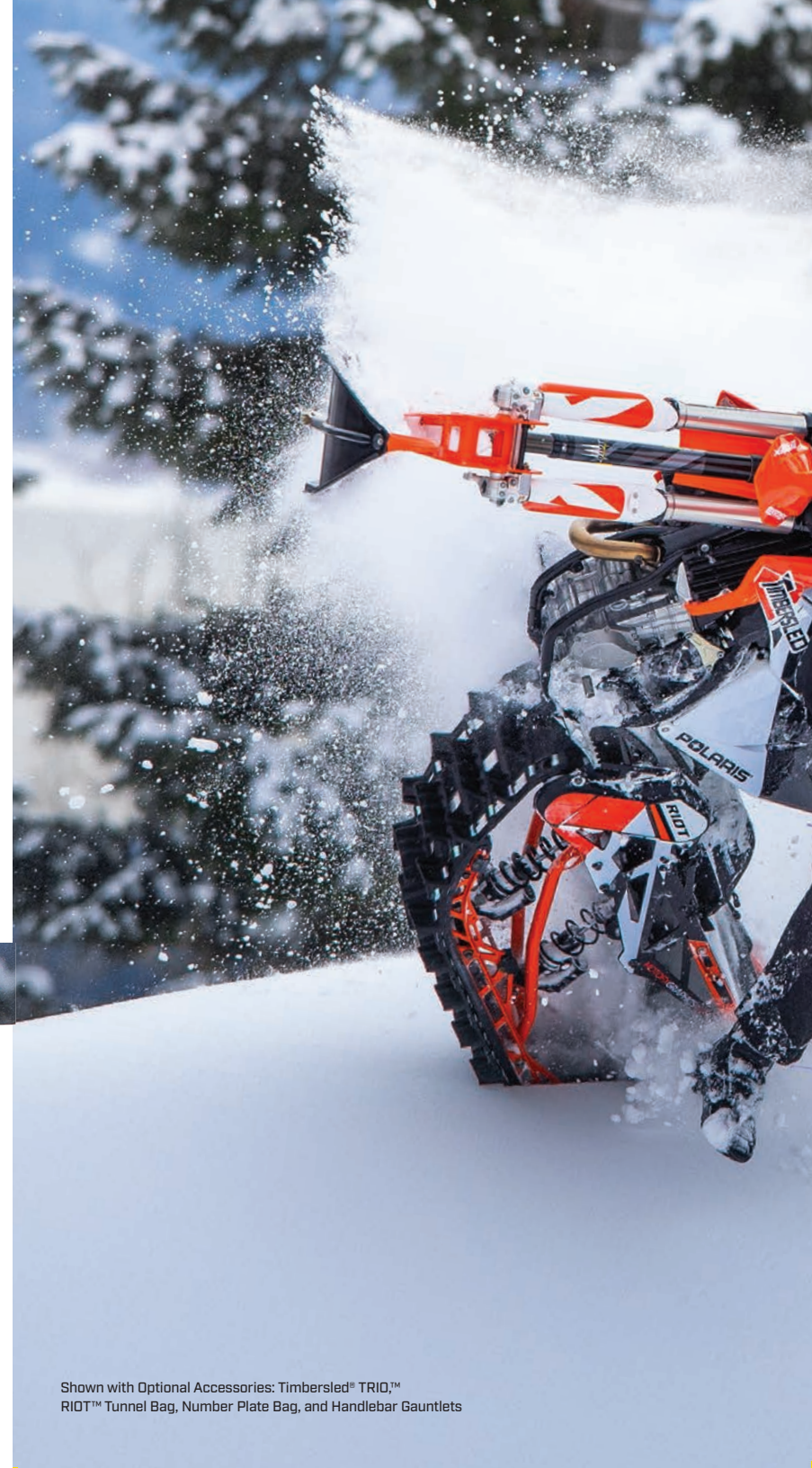
Shown with Optional Accessories: Timbersled® TRIO™, RIOT™ Tunnel Bag, Number Plate Bag, and Handlebar Gauntlets