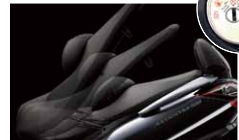
Seat Open Combined Into Main Switch