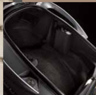
Luggage Box Illumination Light And Anti-theft Safety Switch