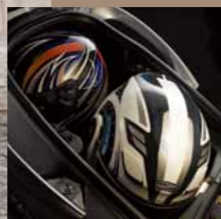
Spacious Under-seat Luggage Box For 2 Full-face Helmets