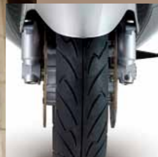
Front Double Disk (Φ 275mm), Rear Single Disk (Φ 275mm)