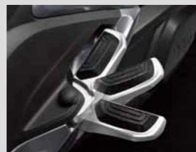
Foldable Foot Step

The powerful engine with 33ps/2.5kgm output is ready to comply your driving aspiration, with twin radial mount front caliper first seen on scooter to guard your safety. All these combined with spacious frame and practical equipment layout makes Maxsym 400i your best partner in your life.