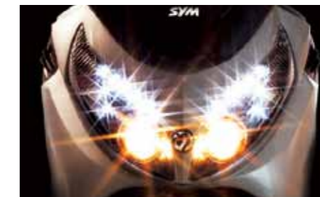
Dual Projector High / Low Headlight with LED Position Light