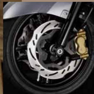
Twin Radial-Mount Front Brake Calipers