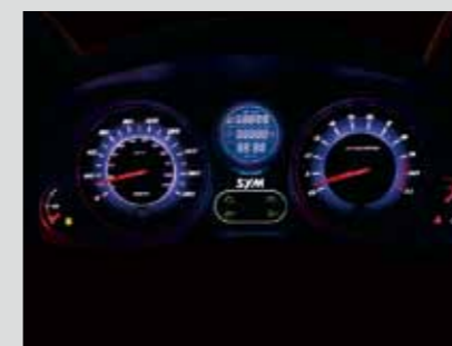
Multi LCD Speedometer