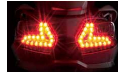
LED Matrix Rear Position Light