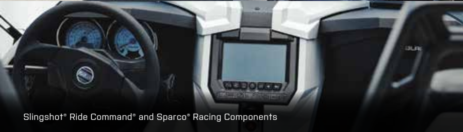
Slingshot® Ride Command® and Sparco® Racing Components