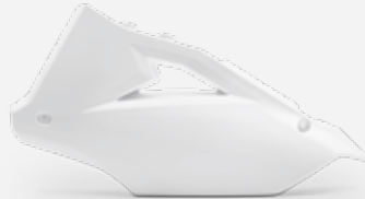
SIDE PANEL LEFT (WHITE)