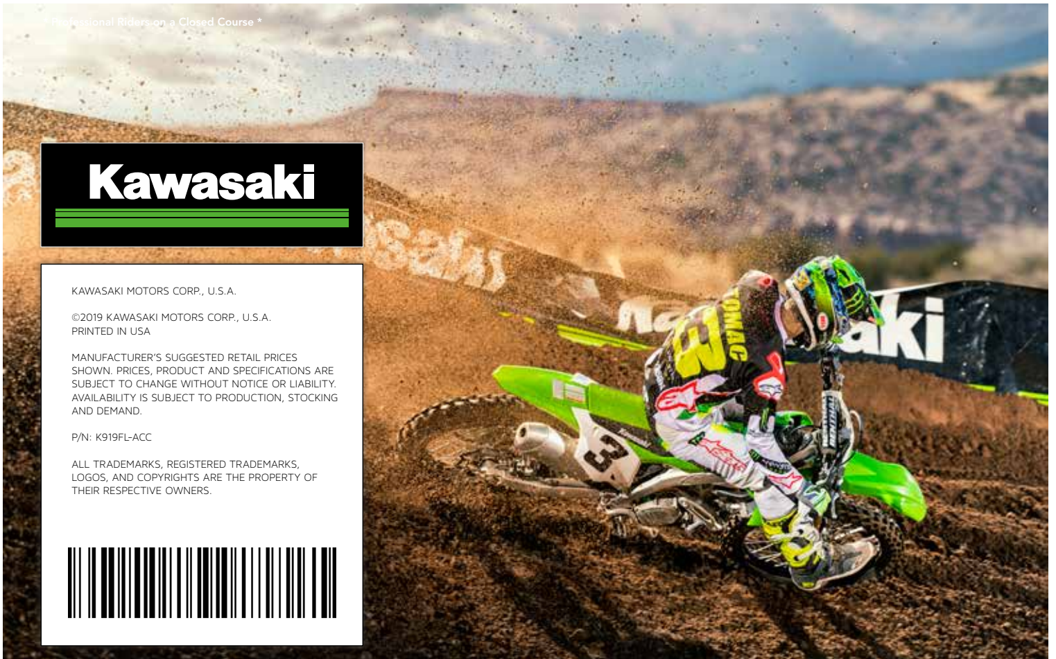
* Professional Riders on a Closed Course *