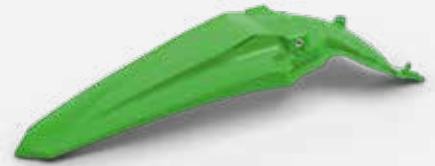
FRONT / REAR FENDER (GREEN / WHITE)