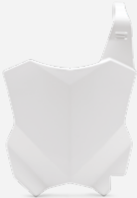
NUMBER PLATE (WHITE)