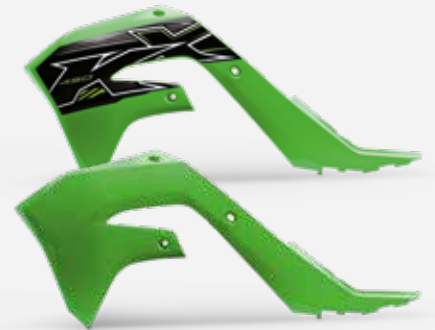
RADIATOR SHROUD LEFT (OPTIONAL DECALS)