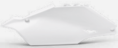
SIDE PANEL RIGHT (WHITE)