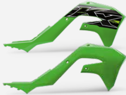
RADIATOR SHROUD RIGHT (OPTIONAL DECALS)