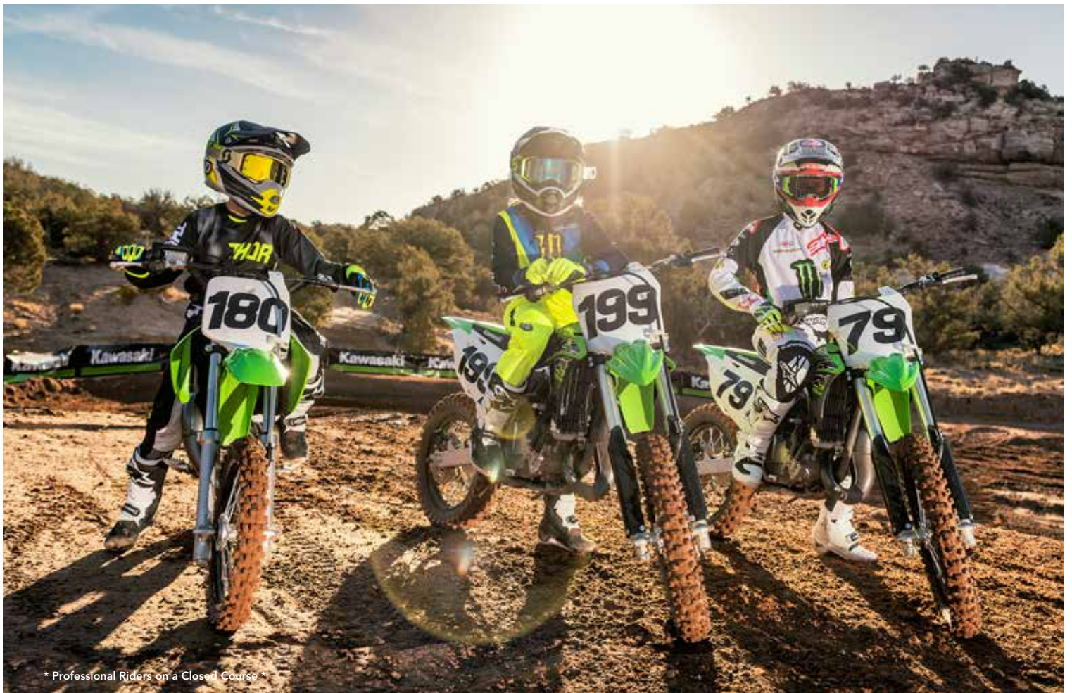
* Professional Riders on a Closed Course *