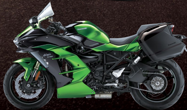
Emerald Blazed Green with Metallic Diablo Black