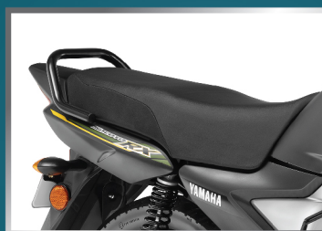
EXTRA LONG SEAT FOR TANDEM RIDE COMFORT