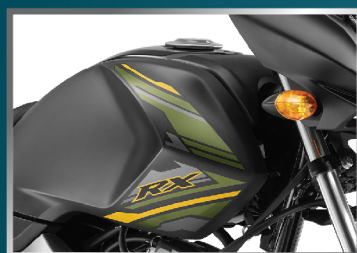
NEW COLOURS AND GRAPHICS