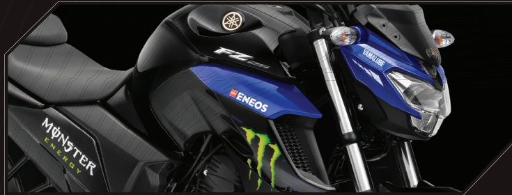
Special MotoGP Graphics