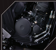
Powerful 249cc Engine