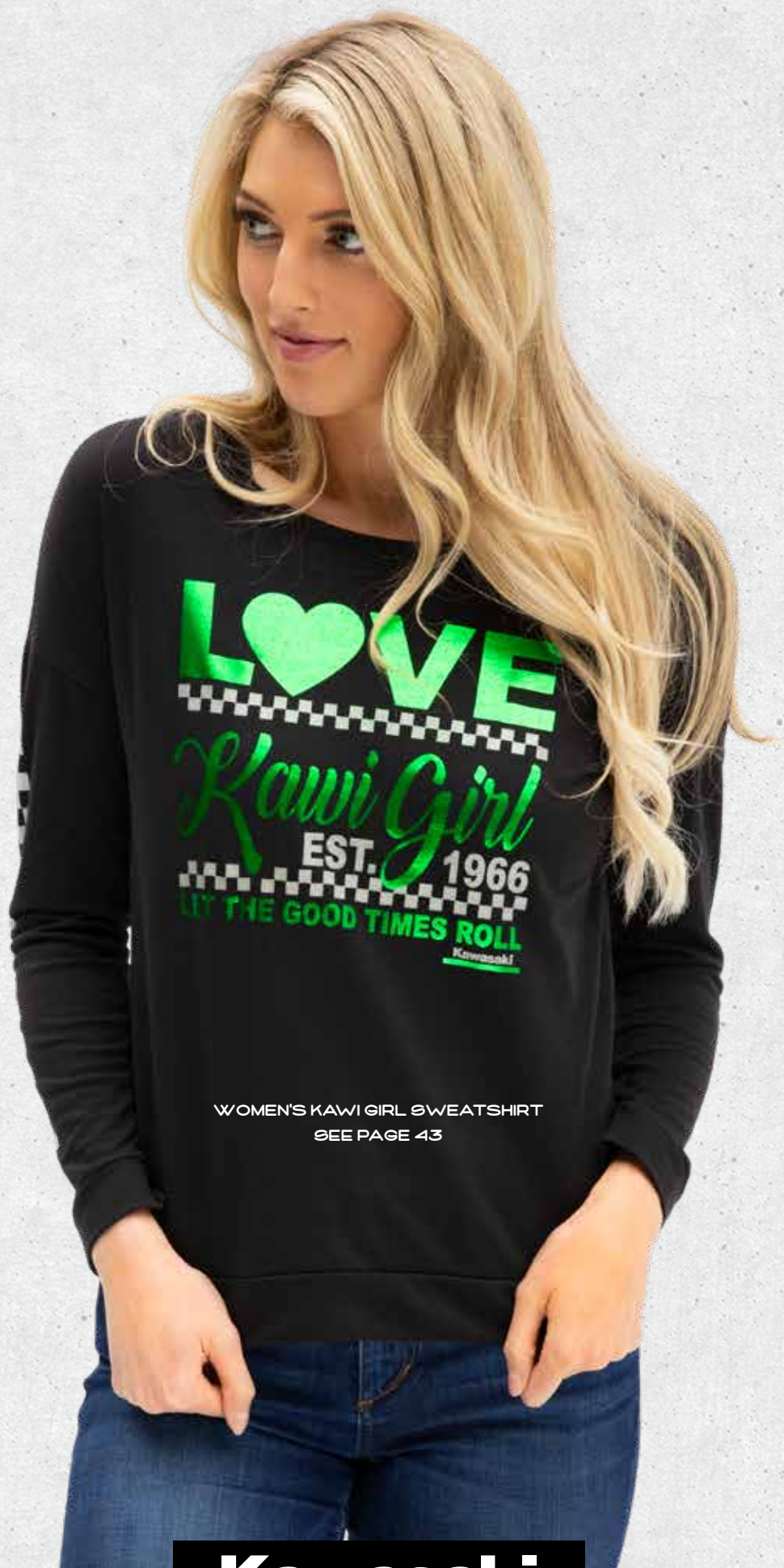
WOMEN'S KAWI GIRL SWEATSHIRT SEE PAGE 43