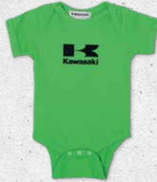
INFANT STACKED LOGO ONSIE 100% cotton • 1 X 1 rib knit • Lap shoulder sleeves GREEN - $18.95.....K056-2597-GN (06,12,18,24)