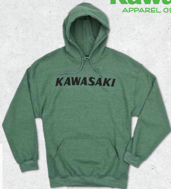
KAWASAKI HERITAGE LOGO HOODED SWEATSHIRT