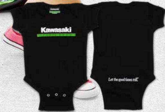
INFANT KAWASAKI 3 GREEN LINES ONSIE 100% ringspun cotton BLACK - $20.95.....K059-2549-BK (06,12,18,24)