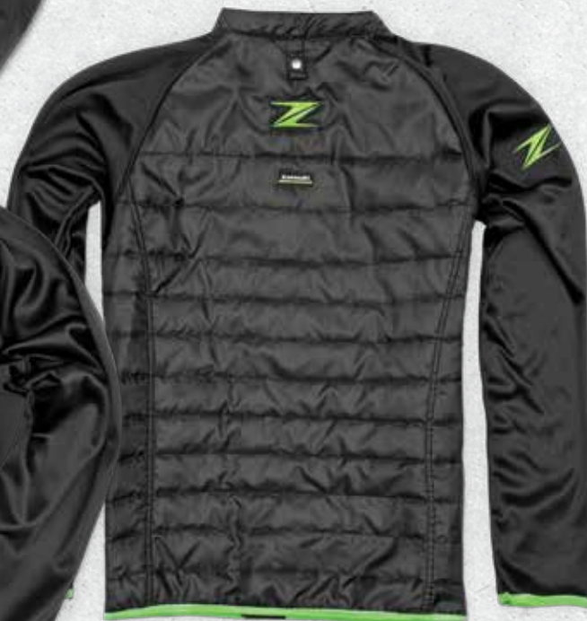
INNER LINER BACK