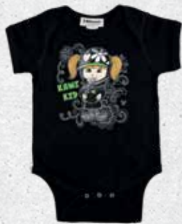
GIRL'S INFANT KAWI KID ONSIE 100% Ringspun Cotton BLACK - $20.95.....K053-2571-BK (12,18, 24)