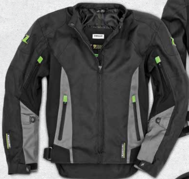
OUTER JACKET FRONT