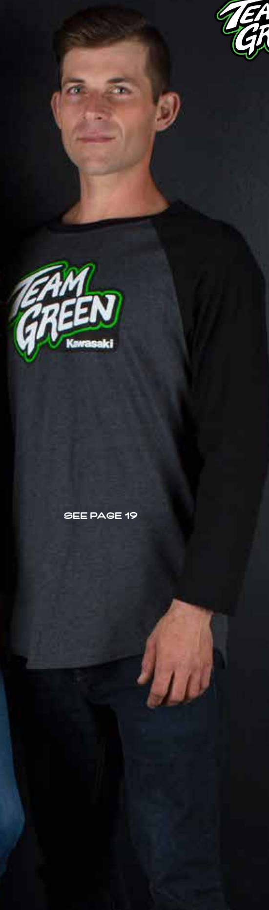
SEE PAGE 19