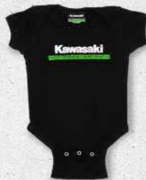
SEE PAGE 52