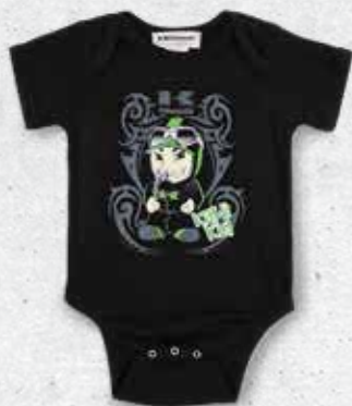
SEE PAGE 52