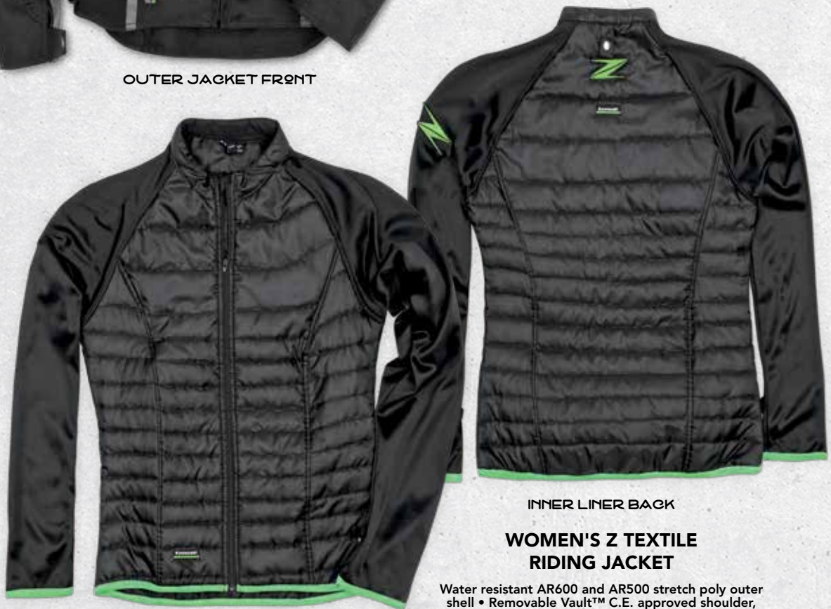
INNER LINER BACK