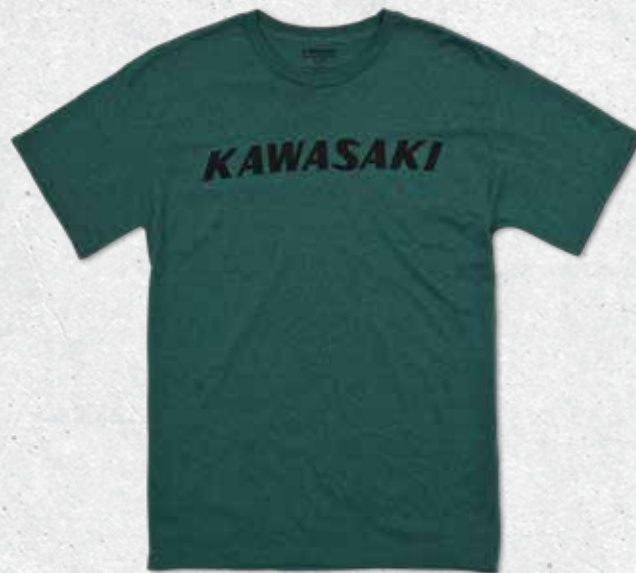
KAWASAKI HERITAGE LOGO T-SHIRT

HEATHER GREEN - $40.95.....K009-1074-BK (SM-3X)