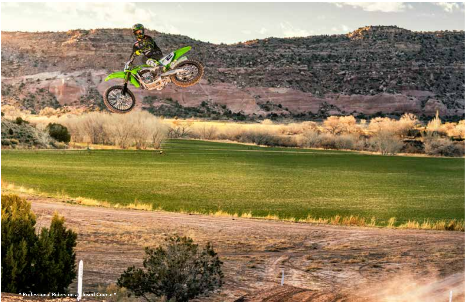
* Professional Riders on a Closed Course *