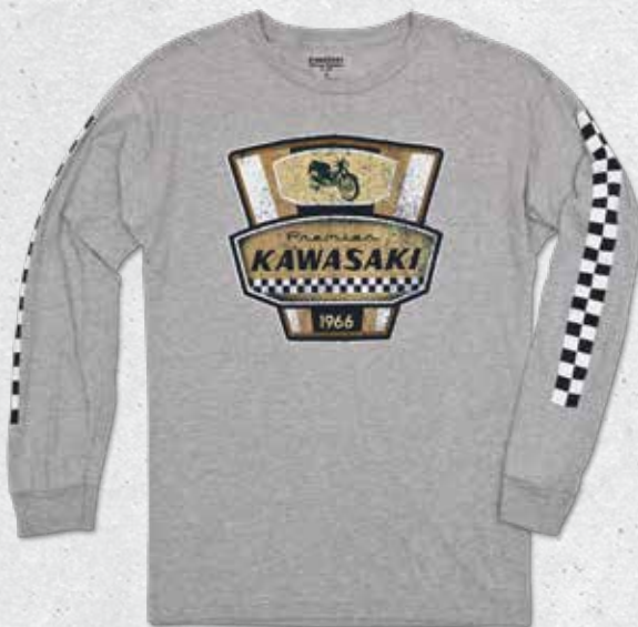
KAWASAKI HERITAGE LONG SLEEVE PREMIER T-SHIRT

HEATHER GREEN - $19.95.....K009-2535-GN (SM-3X)