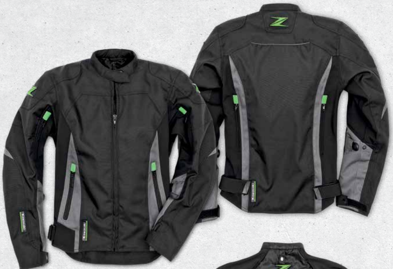
OUTER JACKET FRONT