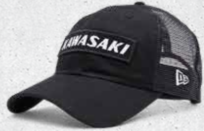
SEE PAGE 29