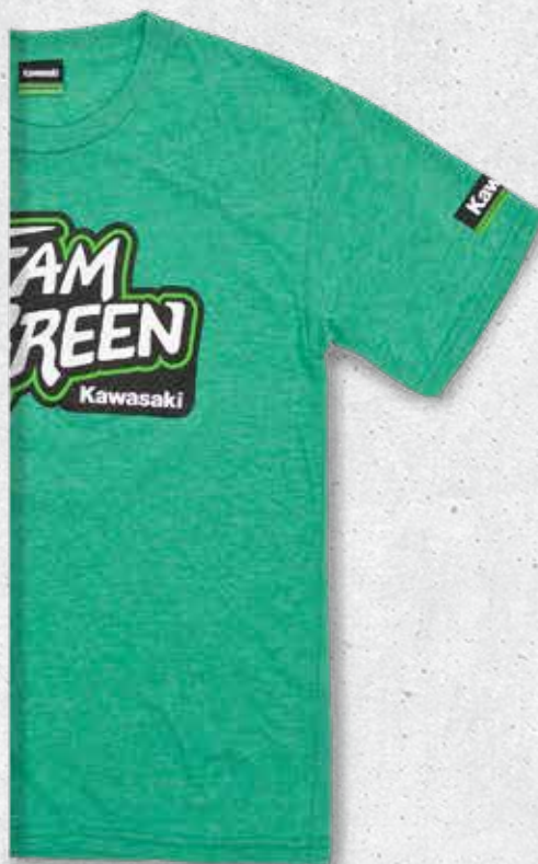
SEE PAGE 51