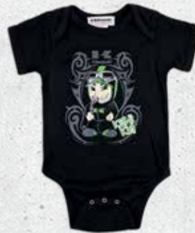
BOY'S INFANT KAWI KID ONSIE 100% Ringspun Cotton BLACK - $20.95.....K053-2570-BK (06,12,18)