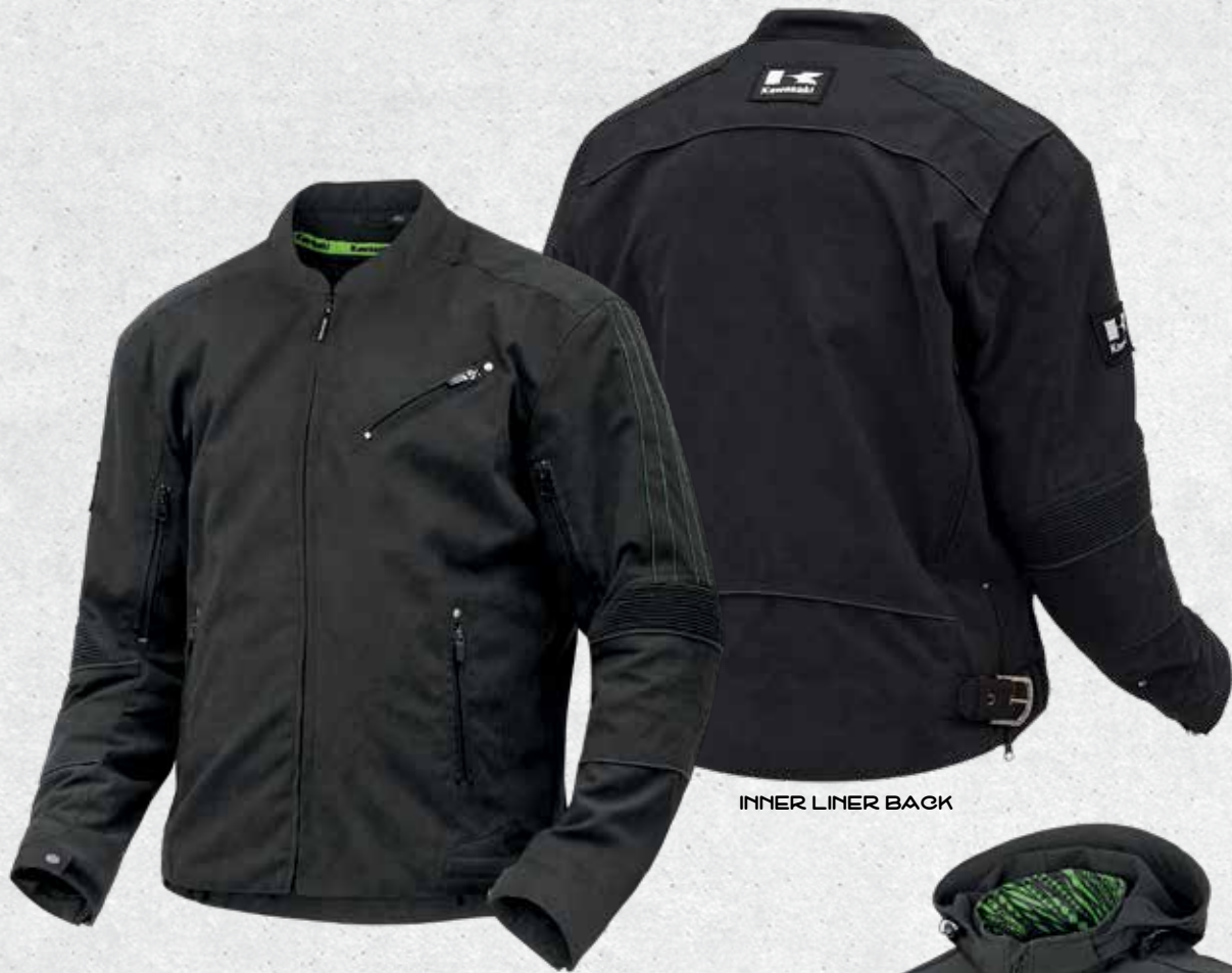
INNER LINER BACK