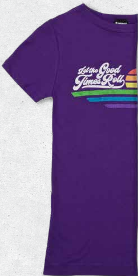
SEE PAGE 50