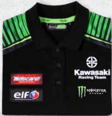
SEE PAGE 03