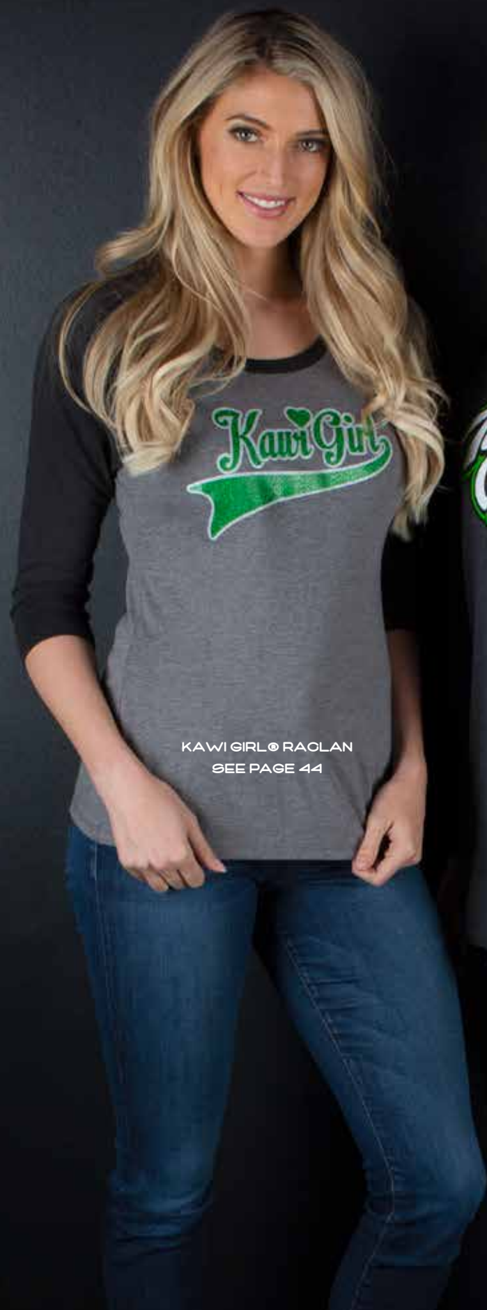
KAWI GIRL® RAOLAN SEE PAGE 44