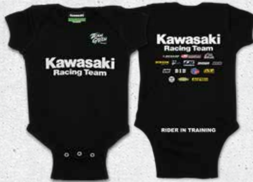
INFANT KAWASAKI RACING TEAM ONSIE 100% ringspun cotton BLACK - $22.95.....K059-3003-BK (06, 12, 18, 24)