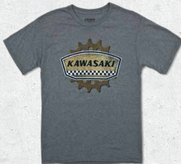
KAWASAKI HERITAGE SPROCKET T-SHIRT

HEATHER GREY - $29.95.....K009-2536-GY (SM-3X)