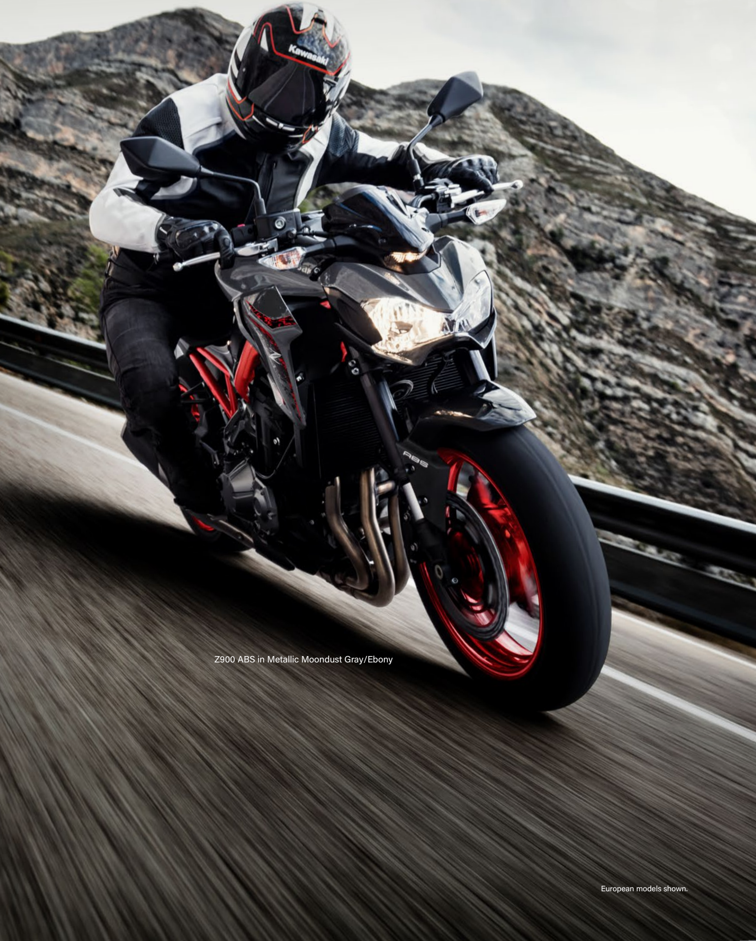
Z900 ABS in Metallic Moondust Gray/Ebony