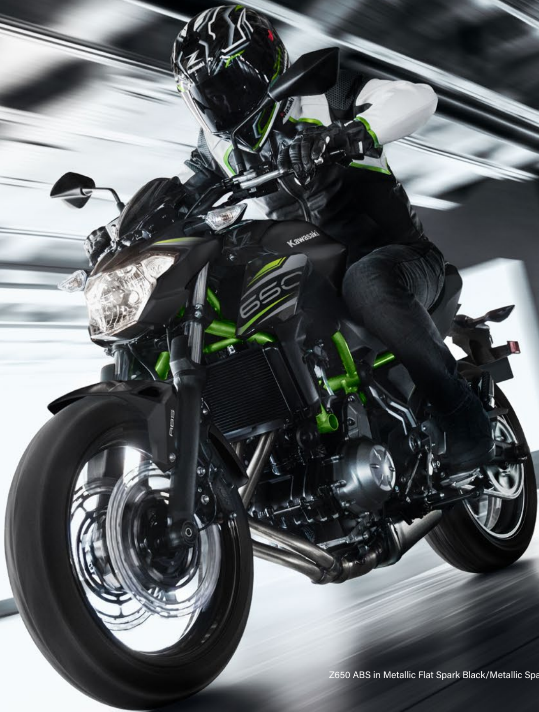
Z650 ABS in Metallic Flat Spark Black/Metallic Spark Black