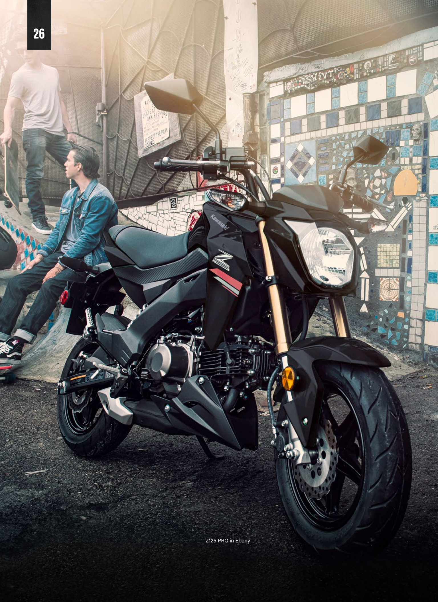
Z125 PRO in Ebony