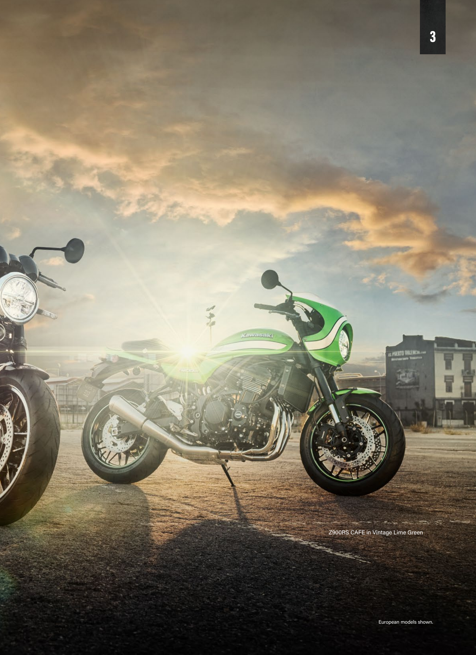
Z900RS CAFE in Vintage Lime Green