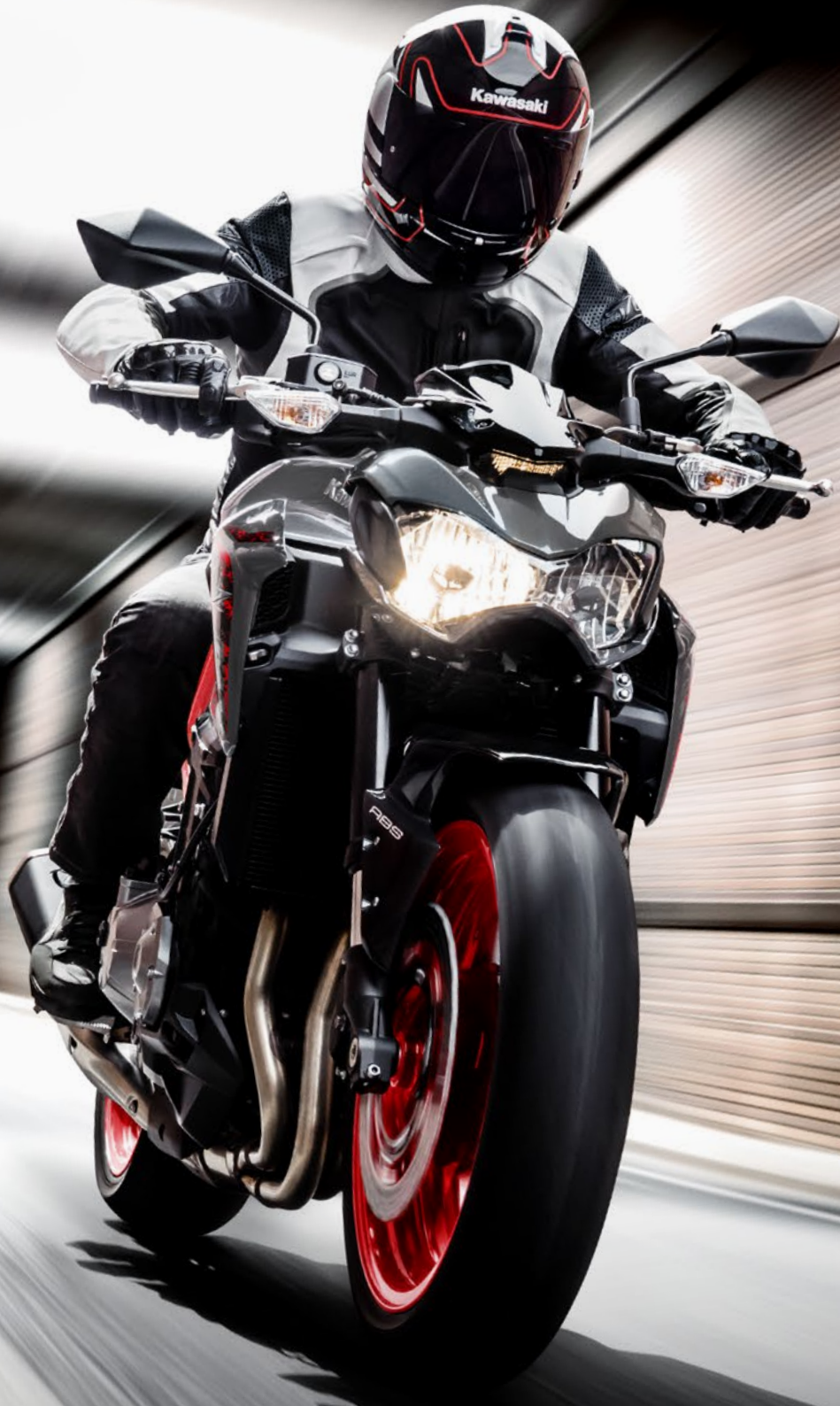
Z900 ABS in Metallic Moondust Gray/Ebony