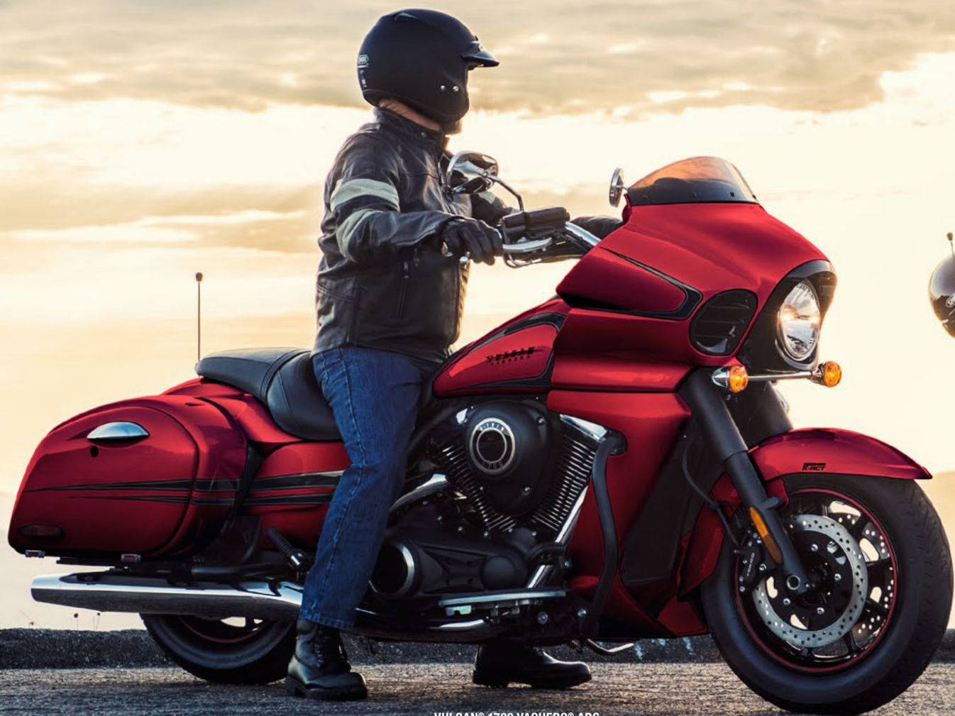
VULCAN® 1700 VAQUERO® ABS