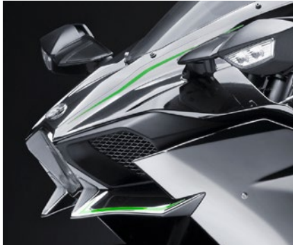
MIRROR COATED SPARK BLACK

**Curb weight includes all necessary materials and fluids to operate correctly, full tank of fuel (more than 90 percent capacity) and tool kit (if supplied). When equipped, California evaporative emissions equipment adds approximately 2.2 lb.