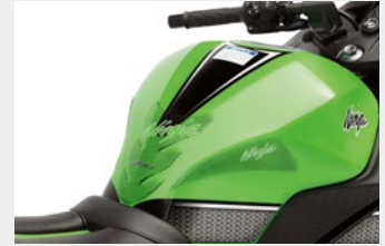
TANK PAD & KNEE PAD SET