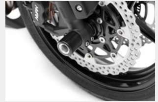
FRONT AXLE SLIDERS