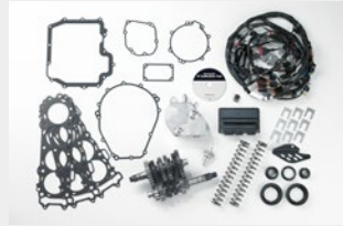
NINJA ZX™-10R RACE KIT PARTS