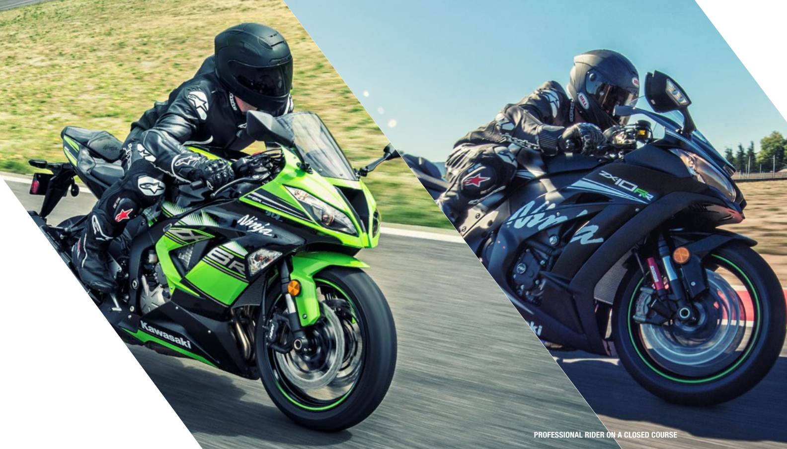
PROFESSIONAL RIDER ON A CLOSED COURSE