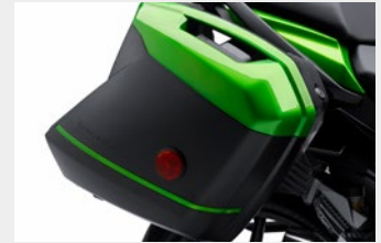
KQR™ SADDLEBAGS (NINJA® 1000 MODEL ONLY)