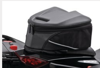
SOFT TOP CASE