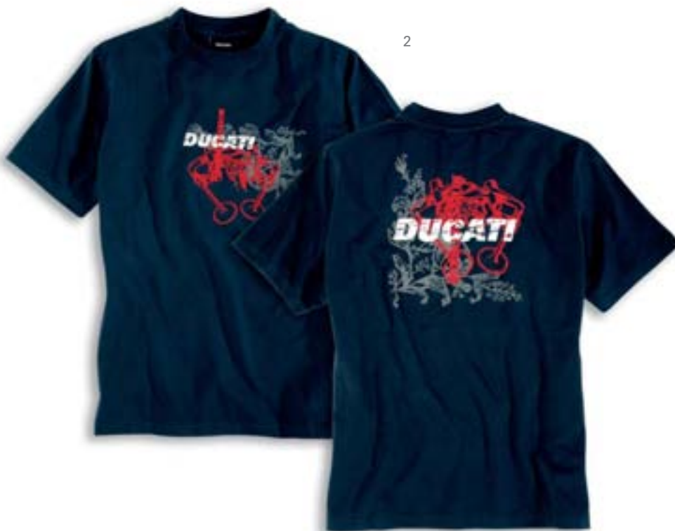
1 - Desmopassion t-shirt 98760704 S-XXXL (grey)