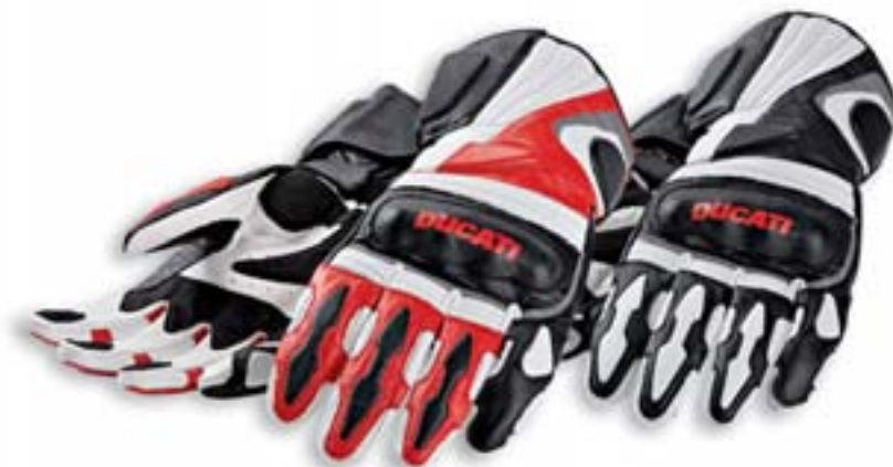
1 - City 10 leather gloves 98100350