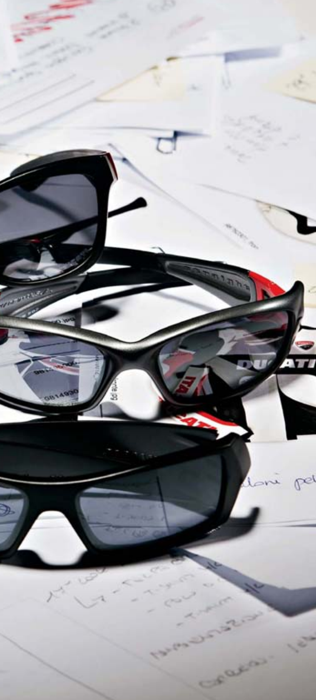
Inmate sunglasses 986960030