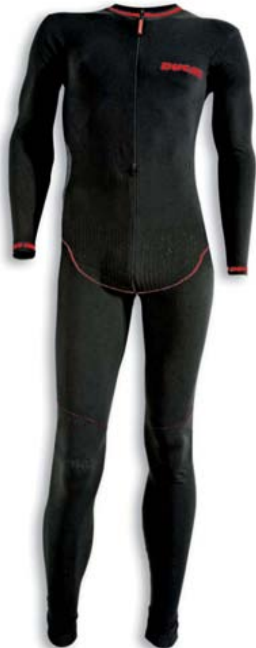
1 - Performance undersuit 98154101 S-XXXL