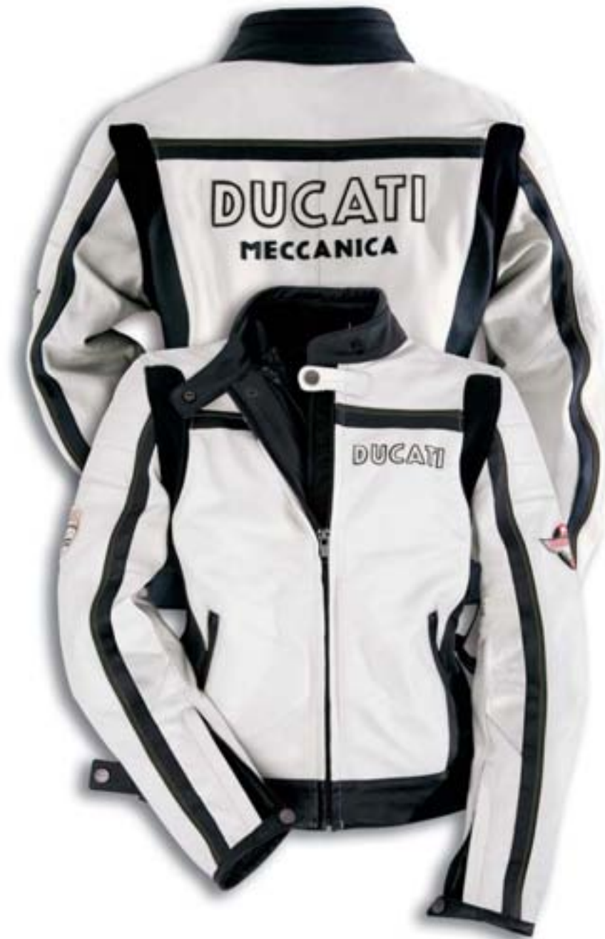
Meccanica leather jacket 98153001 - 98100050 (perf.)