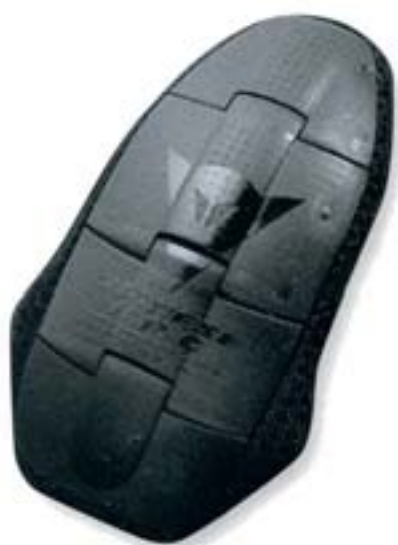
G1/G2 back protector 982622010 (G1 women's) 982621010 (G2 men's)