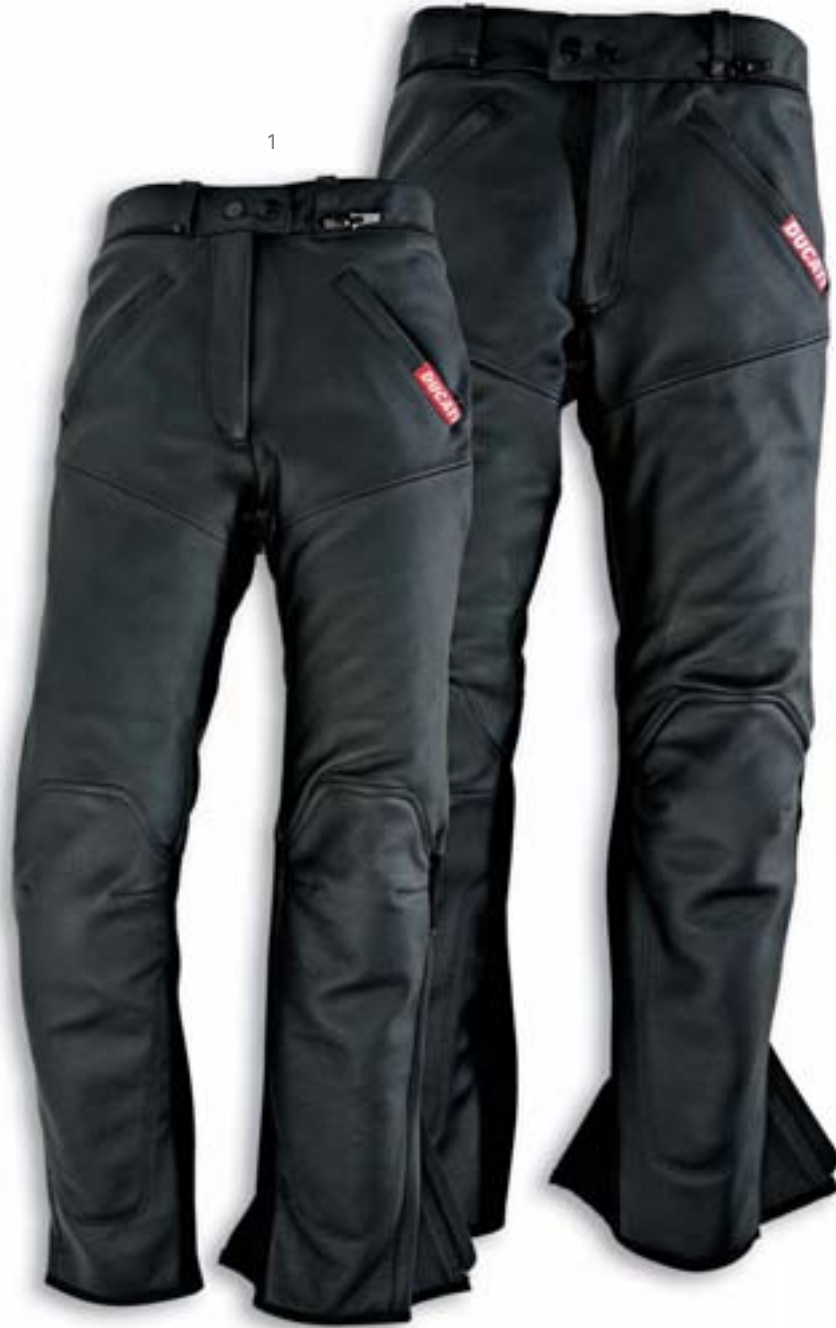
1 - Company women's leather trousers 9810008