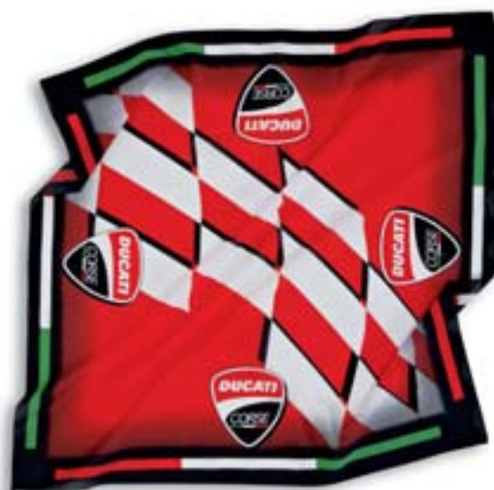
1 - Ducati Corse flag 981004200 148x96cm