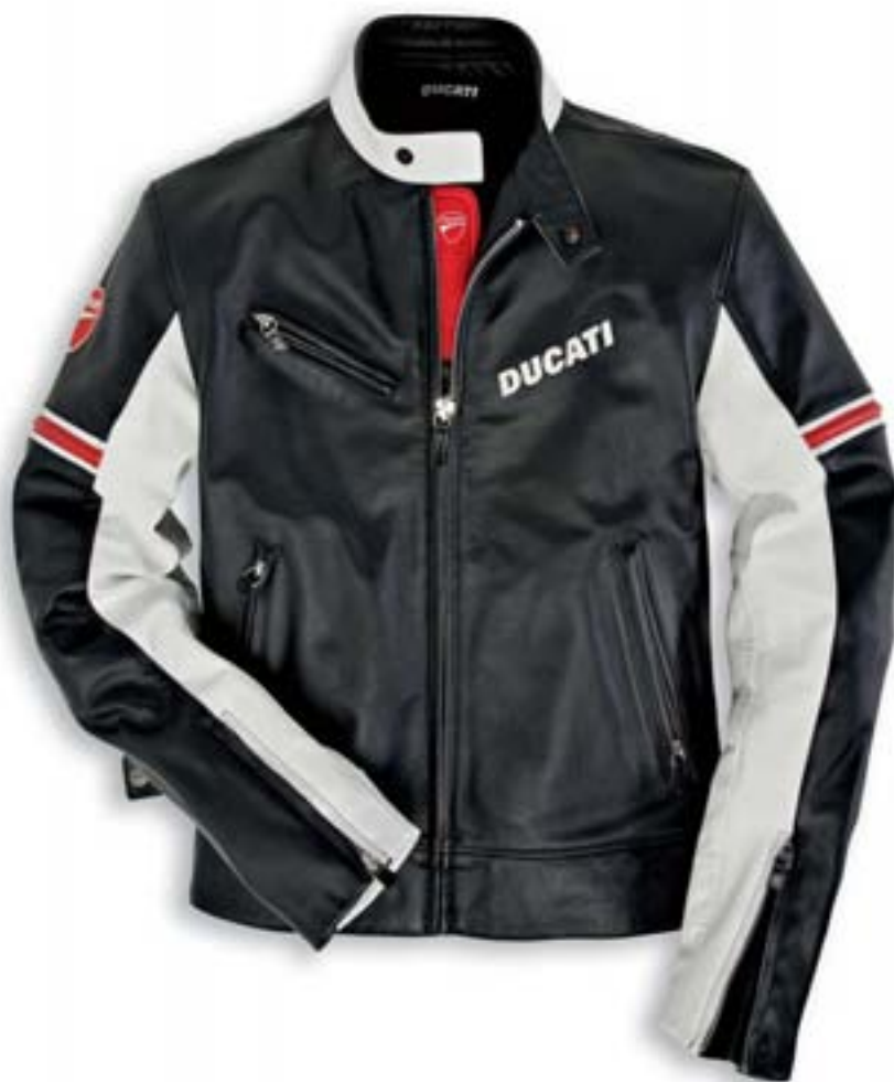
Company leather jacket 9810009 - 9810011 (perf.)