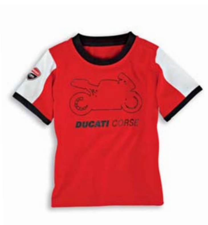
Company kid's t-shirt 9877560 from 2-4 years to 8-10 years