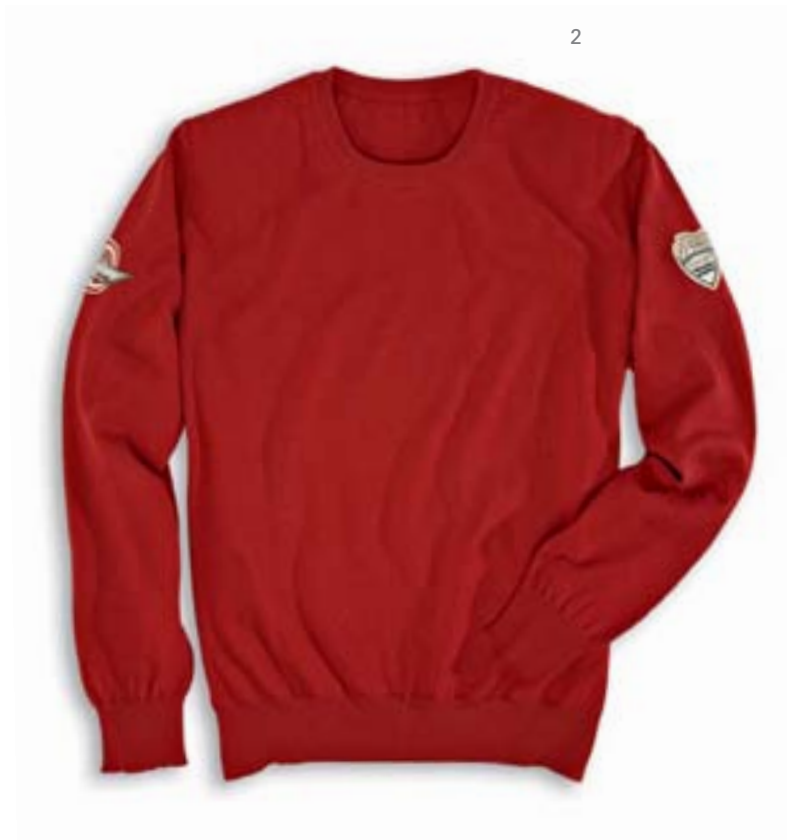
1 - Historical pullover 98761207 S-XXL