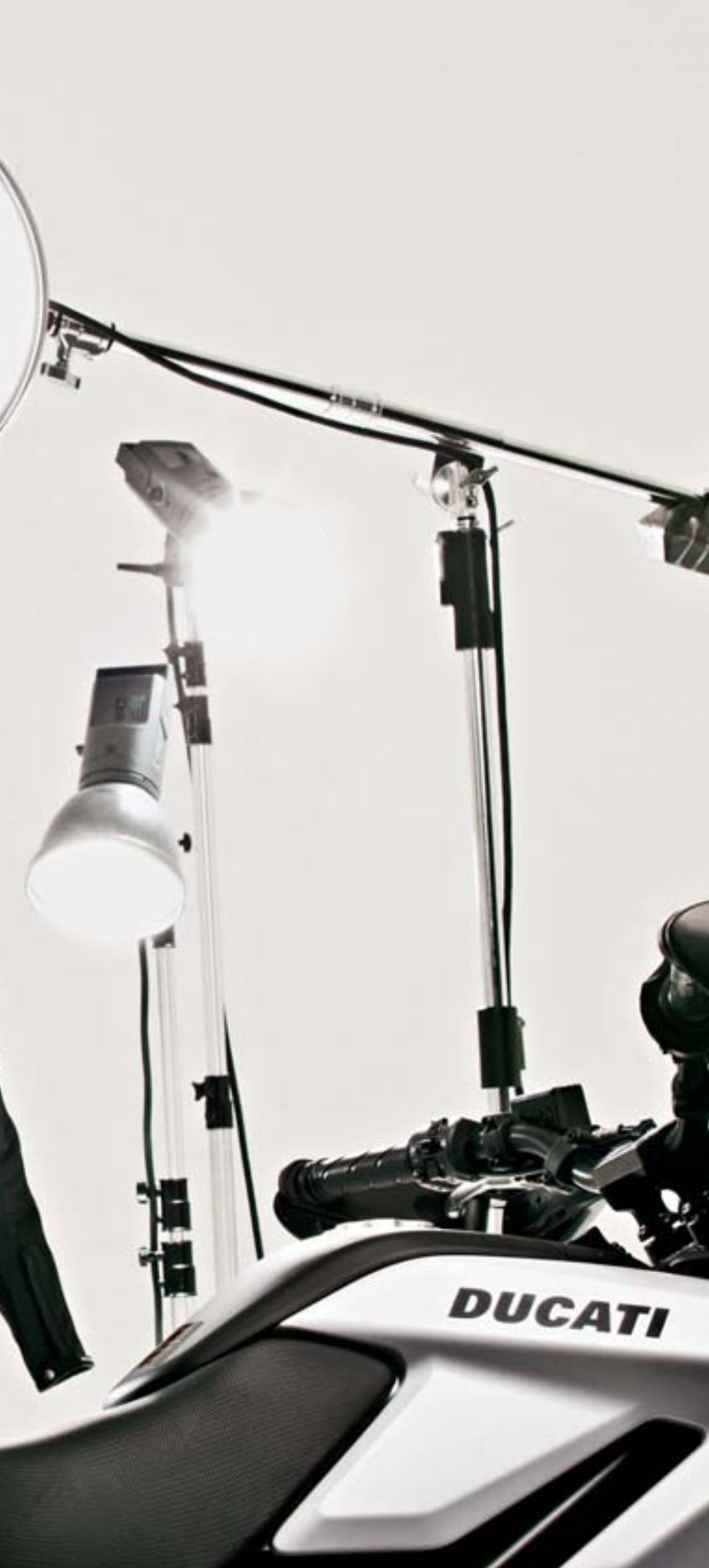
80s leather jacket 9810016 - 9810018 (perf.)