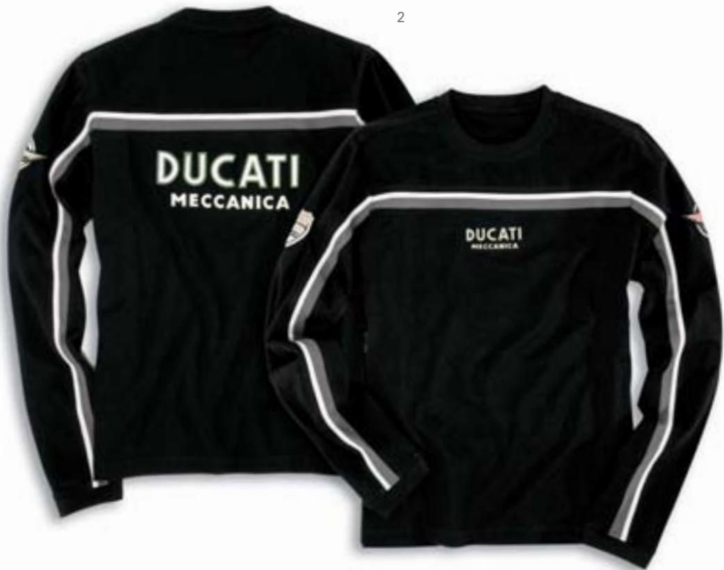
1 - Meccanica sweater 98760301 S-XXL