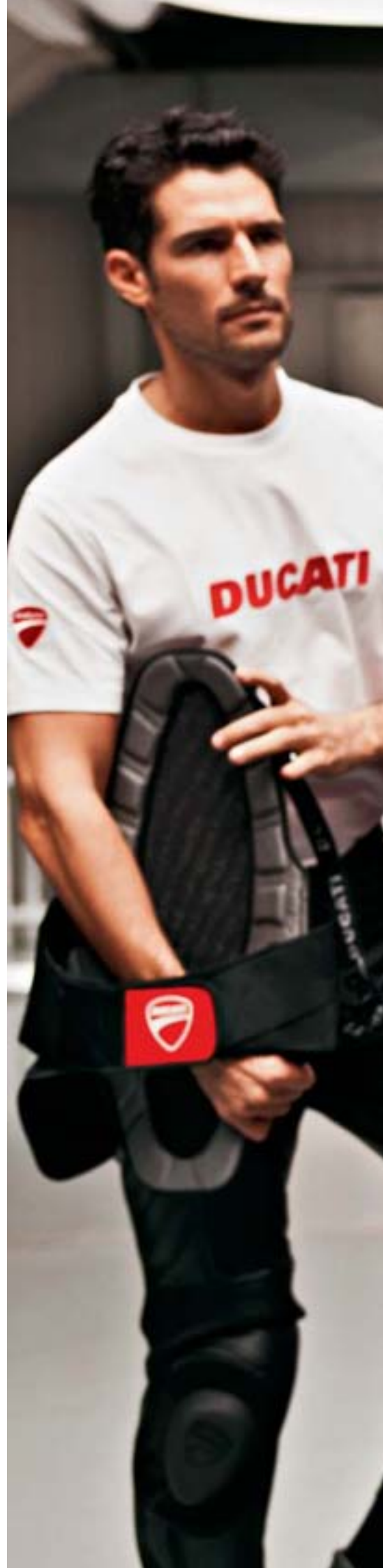
Company 11/12 back protector 98100480 Waist-Shoulder: 37,5 - 42 cm M-L 98100481 Waist-Shoulder: 41,5 - 47 cm M-L