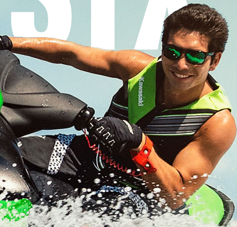
JET SKI ® STX ® -15F in Ebony/Lime Green