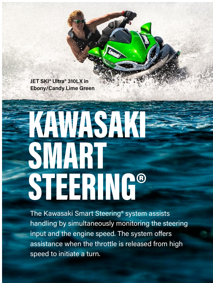
JET SKI® Ultra® 310LX in Ebony/Candy Lime Green

The 1,498cc inline, four-cylinder, supercharged engine is the undisputed king of the water. The high-tech Eaton Twin Vortices Series (TVS) supercharger boosts the compact powerhouse, delivering thrills sure to ignite your senses. The sound and feel as the engine hits max boost pressure leaves no question as to why it sets the standard for power and acceleration.