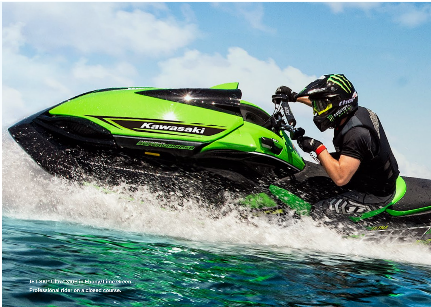
JET SKI® Ultra® 310R in Ebony/Lime Green Professional rider on a closed course.