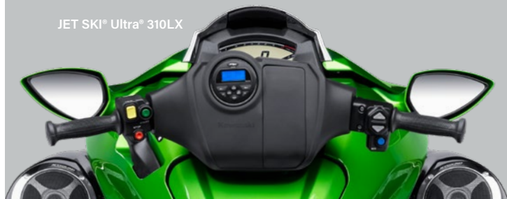
JET SKI® Ultra® 310LX

The Electronic Throttle Valve (ETV) is controlled by the Electronic Control Unit (ECU) and allows multiple riding modes to be activated. Cruise through no-wake zones with one-touch 5 mph mode, while Fuel Economy Assistance mode optimizes fuel efficiency. To aid newer riders, the key-activated Smart Learning Operation (SLO) mode reduces engine power output and top speed.