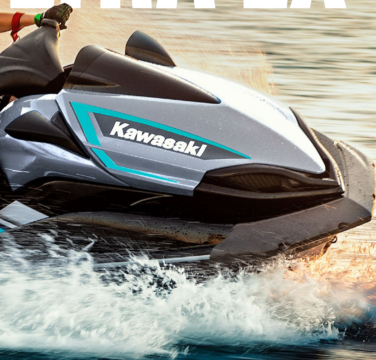
JET SKI® Ultra® LX in Ebony/Metallic Tungsten Gray