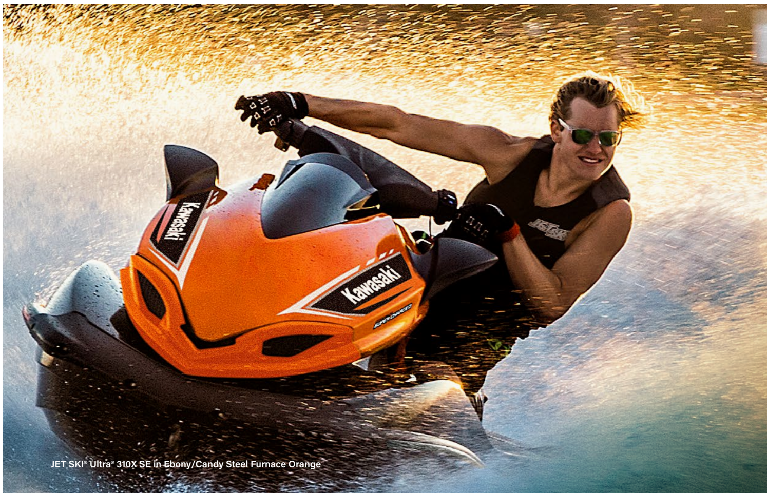
JET SKI® Ultra® 310X SE in Ebony/Candy Steel Furnace Orange