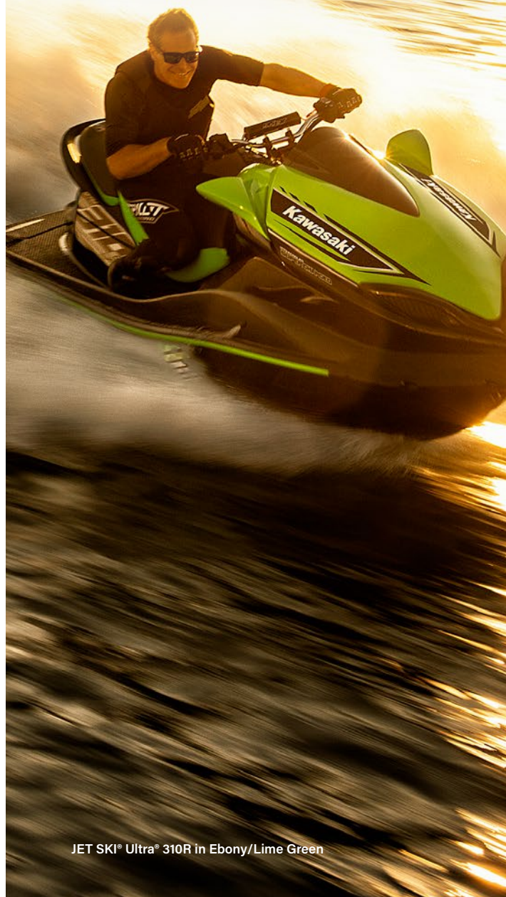
JET SKI® Ultra® 310R in Ebony/Lime Green