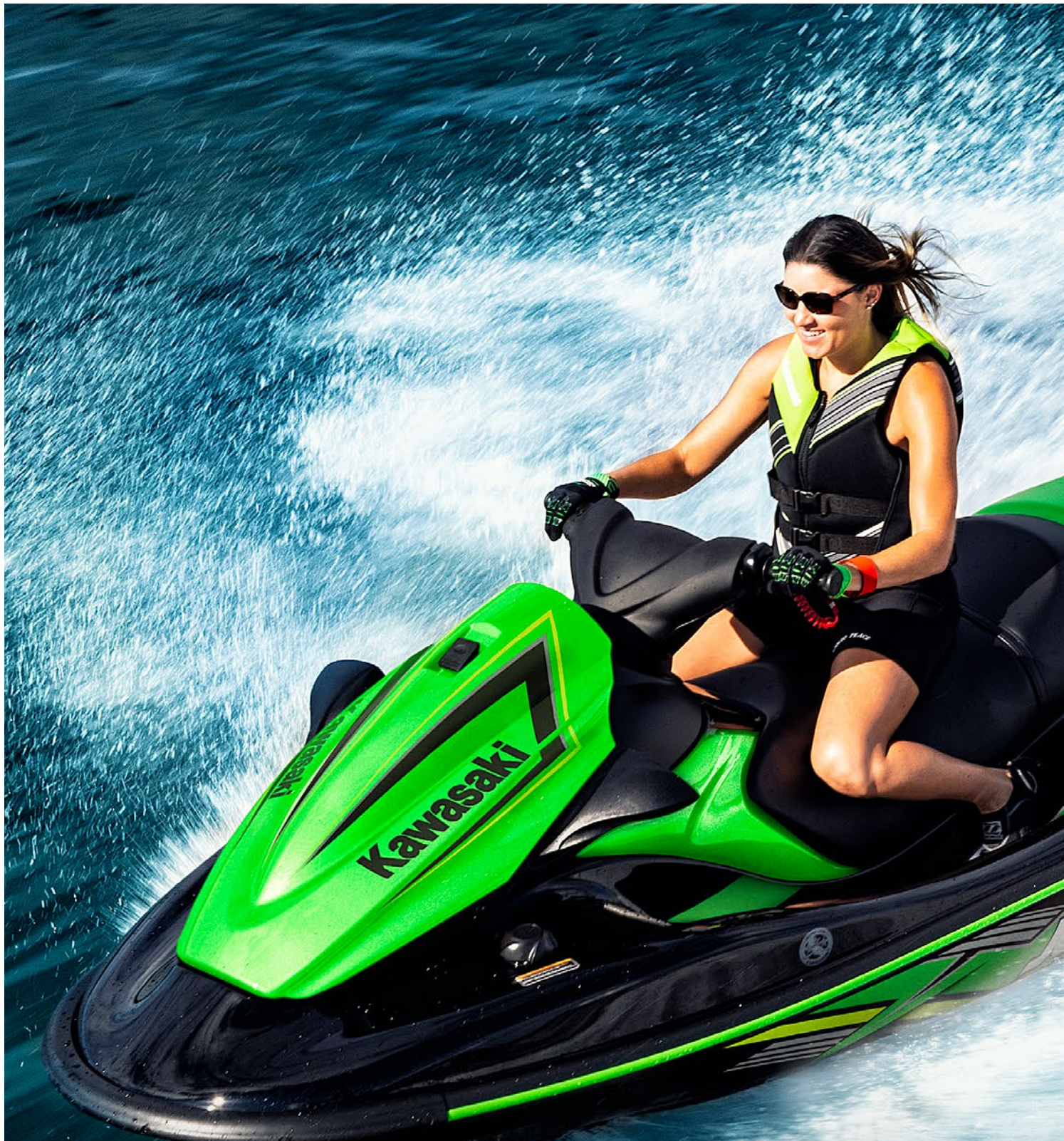
JET SKI® STX®-15F in Ebony/Lime Green