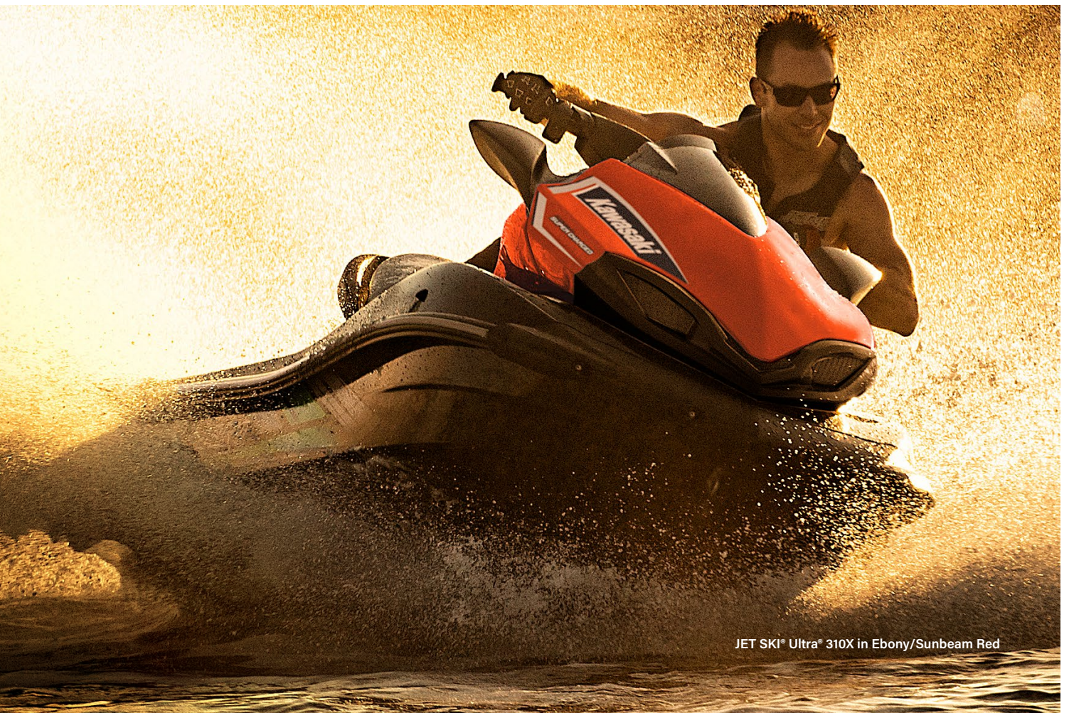
JET SKI® Ultra® 310X in Ebony/Sunbeam Red

Gain the sporting edge on the water with the JET SKI® Ultra® 310X SE watercraft. The most powerful production personal watercraft in the world adds a sport seat for enhanced comfort and special edition paint and graphics. Take the incredible performance of the JET SKI Ultra 310X SE to new levels—go the distance or simply enjoy a full day on the water with peak power and sporting comfort.