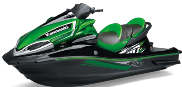
EBONY / CANDY LIME GREEN