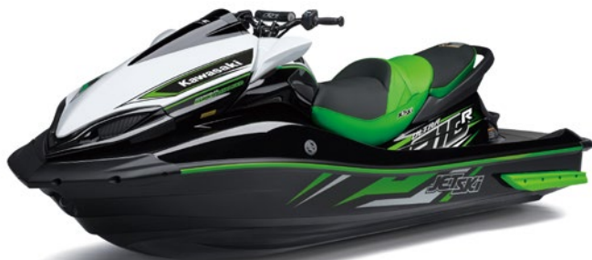
EBONY / METALLIC STARDUST WHITE