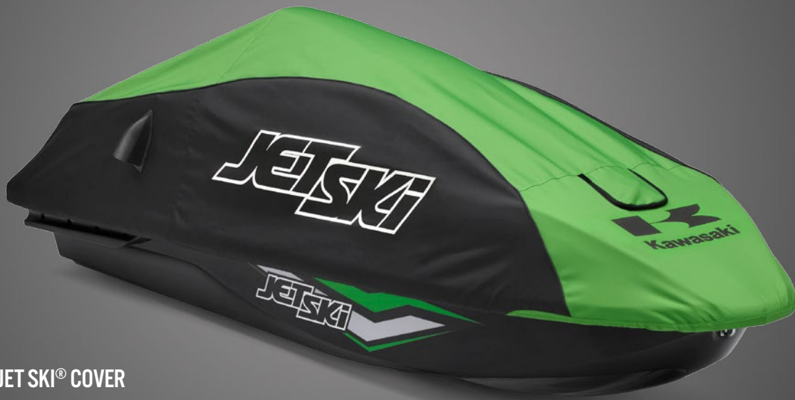
VACU-HOLD JET SKI® COVER