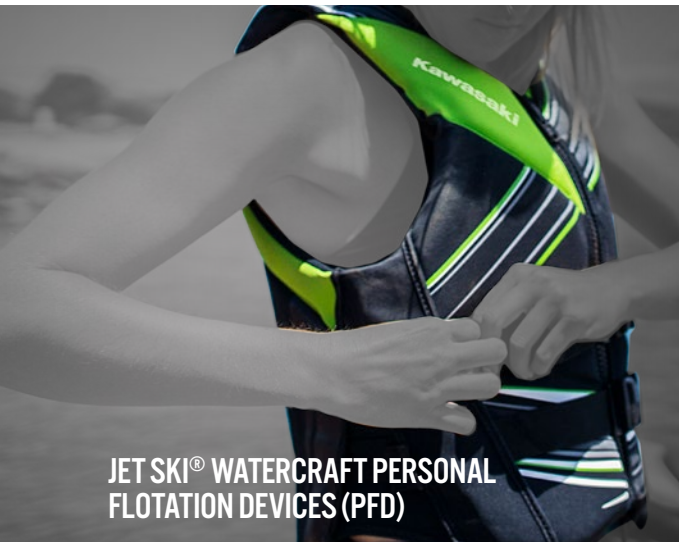
JET SKI® WATERCRAFT PERSONAL FLOTATION DEVICES (PFD)