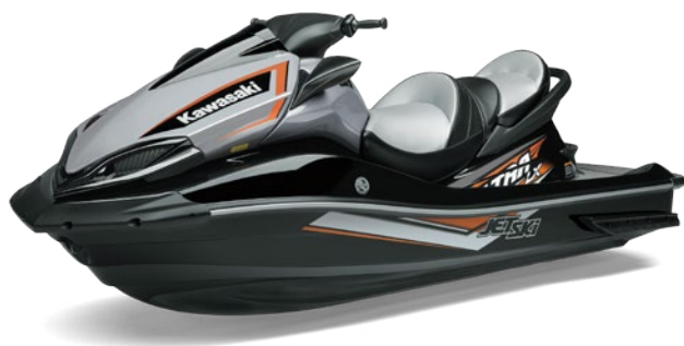
EBONY / METALLIC PHANTOM SILVER