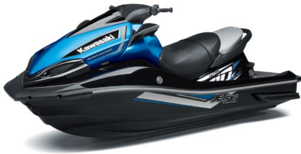
EBONY / METALLIC SURF BLUE