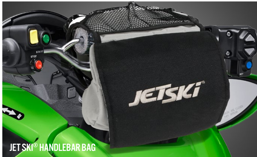
JET SKI® HANDLEBAR BAG