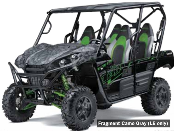
Fragment Camo Gray (LE only)