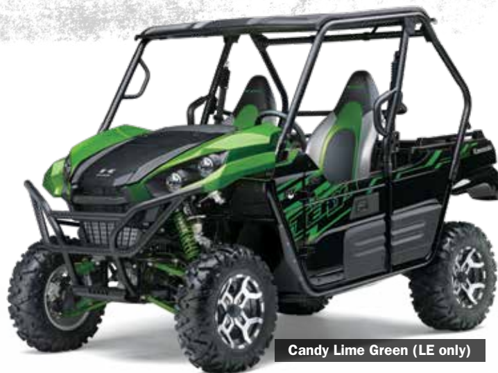
Candy Lime Green (LE only)