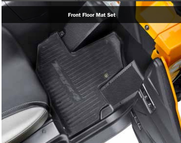
Front Floor Mat Set