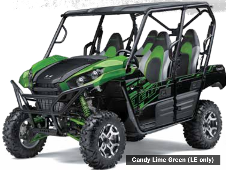
Candy Lime Green (LE only)