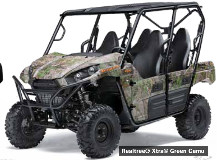
Realtree® Xtra® Green Camo