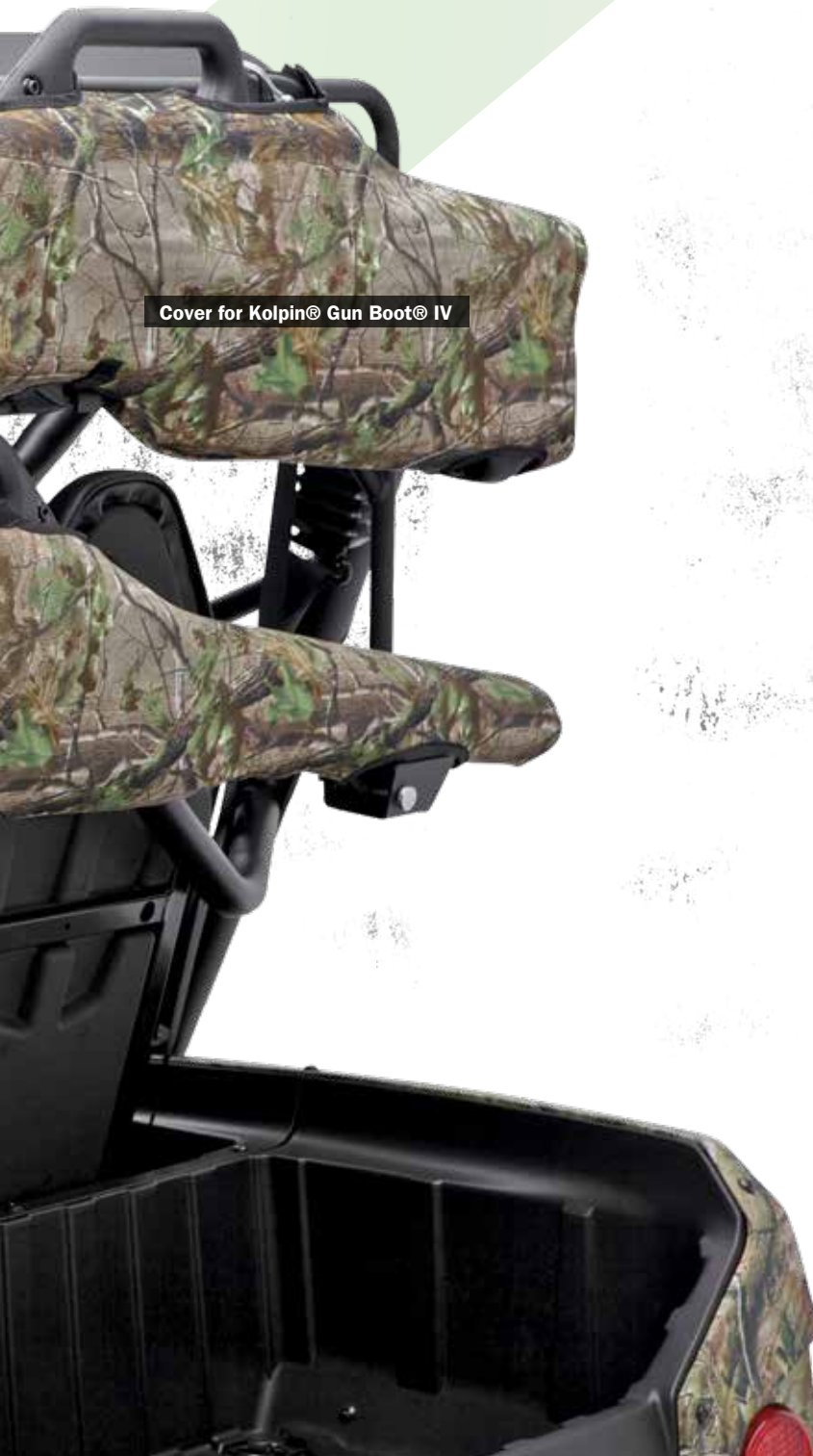
Cover for Kolpin® Gun Boot® IV