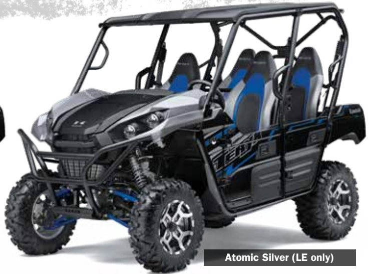
Atomic Silver (LE only)