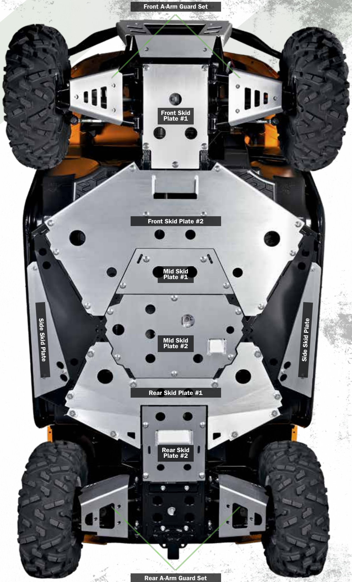
Front A-Arm Guard Set