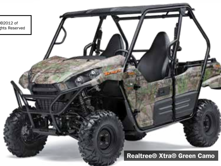
Realtree® Xtra® Green Camo

Realtree APG-XTRA Camouflage Design ©2012 of Jordan Outdoor Enterprises, Ltd., All Rights Reserved