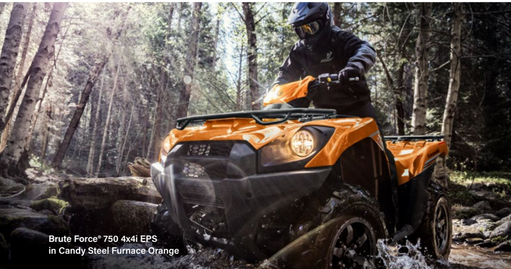
Brute Force® 750 4x4i EPS in Candy Steel Furnace Orange

Durability and strength are the result of a reinforced double-cradle frame. Independent suspension smooths out rough terrain with pre-load adjustable shocks.