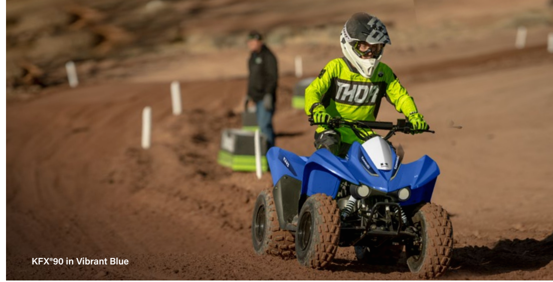
KFX®90 in Vibrant Blue