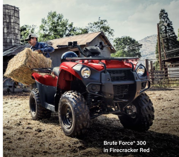
Brute Force® 300 in Firecracker Red