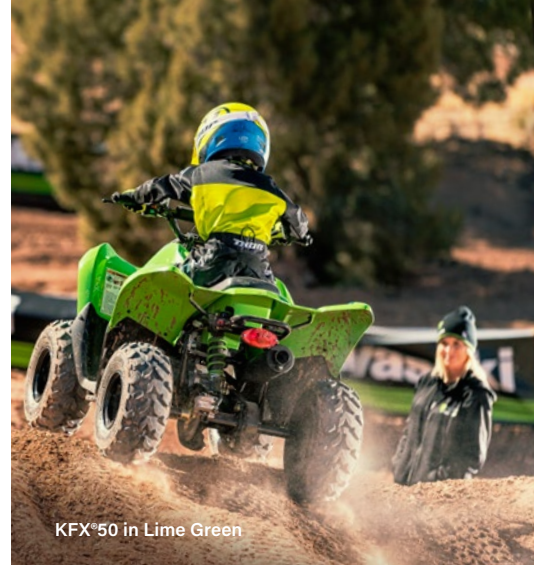
KFX®50 in Lime Green