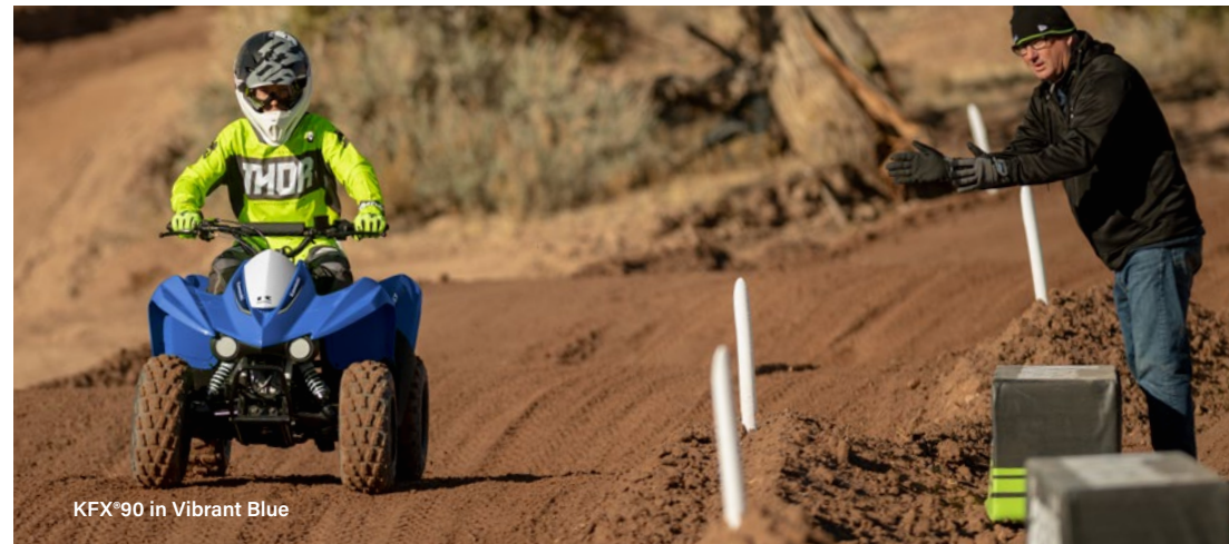
KFX®90 in Vibrant Blue

Smooth and sporty suspension performance is produced by independent front A-arms and a single shock and swingarm in the rear. At higher speeds, the KFX®90 ATV exhibits agile performance and capable handling which riders with more experience can appreciate.