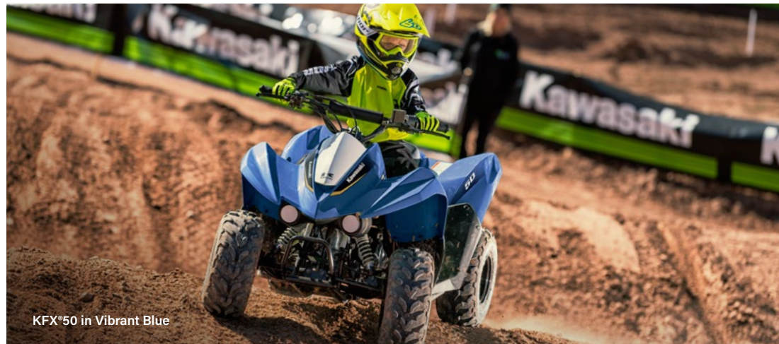
KFX®50 in Vibrant Blue

Two front drum brakes and a rear disc brake provide ample stopping power. All brakes use handlebar-mounted levers. Full-length floorboards help protect feet.