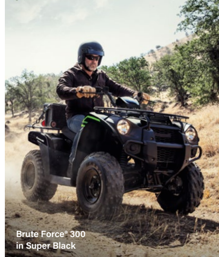
Brute Force® 300 in Super Black