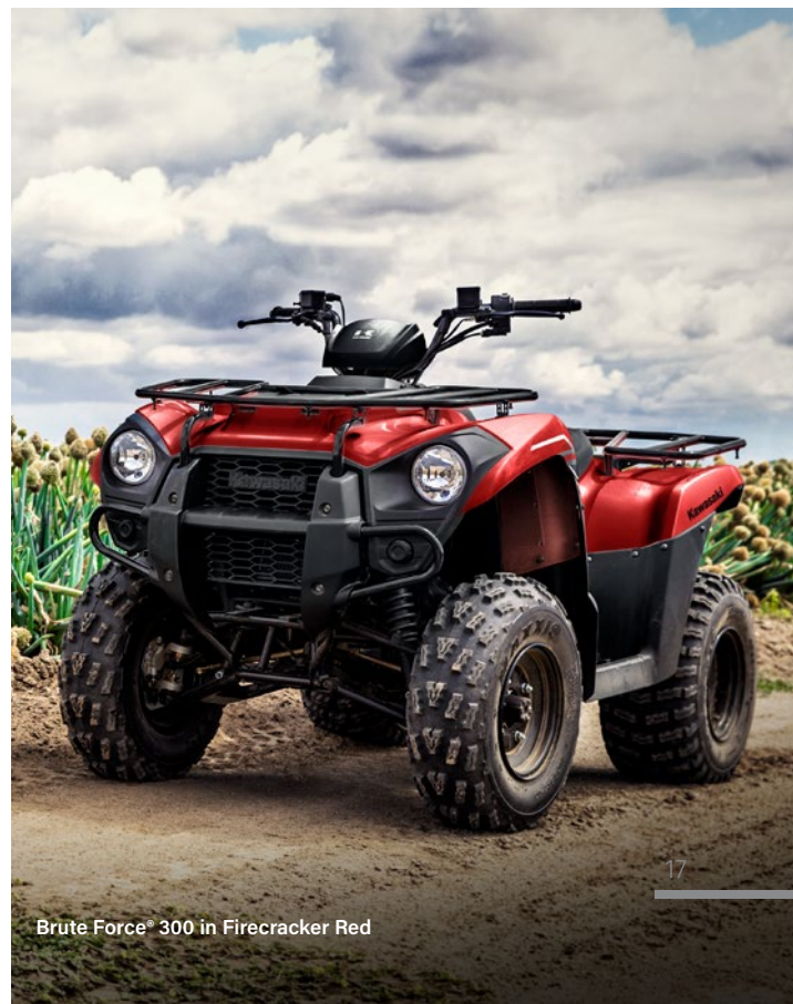
Brute Force® 300 in Firecracker Red