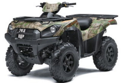
Realtree Xtra® Green Camo