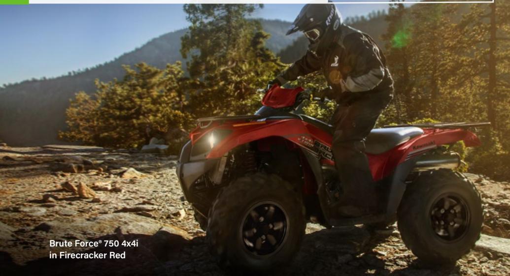
Brute Force® 750 4x4i in Firecracker Red