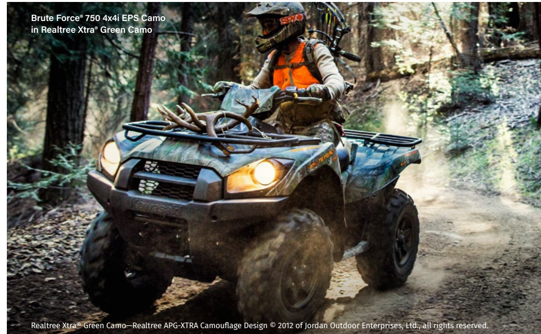
Brute Force® 750 4x4i EPS Camo in Realtree Xtra® Green Camo

The fuel-injected 749cc V-twin engine pumps out strong low-rpm torque for incredible acceleration, while precise fuel metering allows for easy starting and optimum fuel mileage.