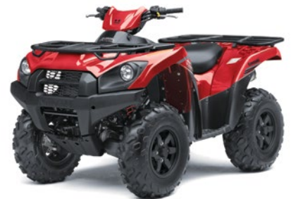
■ Firecracker Red

Realtree Xtra® Green Camo—Realtree APG-XTRA Camouflage Design © 2012 of Jordan Outdoor Enterprises, Ltd., all rights reserved.