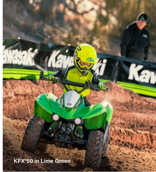
KFX®50 in Lime Green