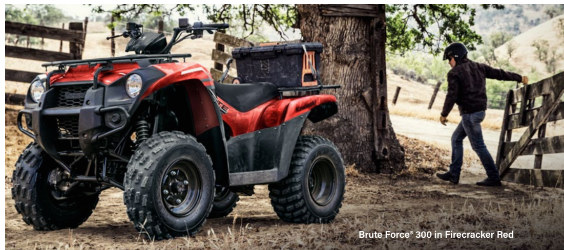
Brute Force® 300 in Firecracker Red

Brute Force® 300 ATVs are built around a strong and durable double cradle steel-tube frame which helps provide outstanding straight-line performance and responsive handling. Independent A-arms in the front and a single shock and swingarm in the rear soak up bumps over rough, uneven terrain to produce a smooth ride.