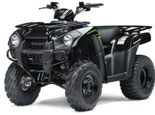
BRUTE FORCE® 300