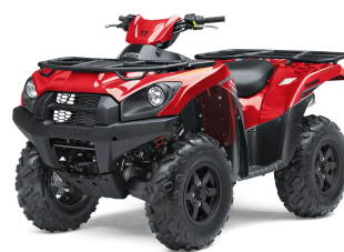
BRUTE FORCE® 750 4x4i EPS