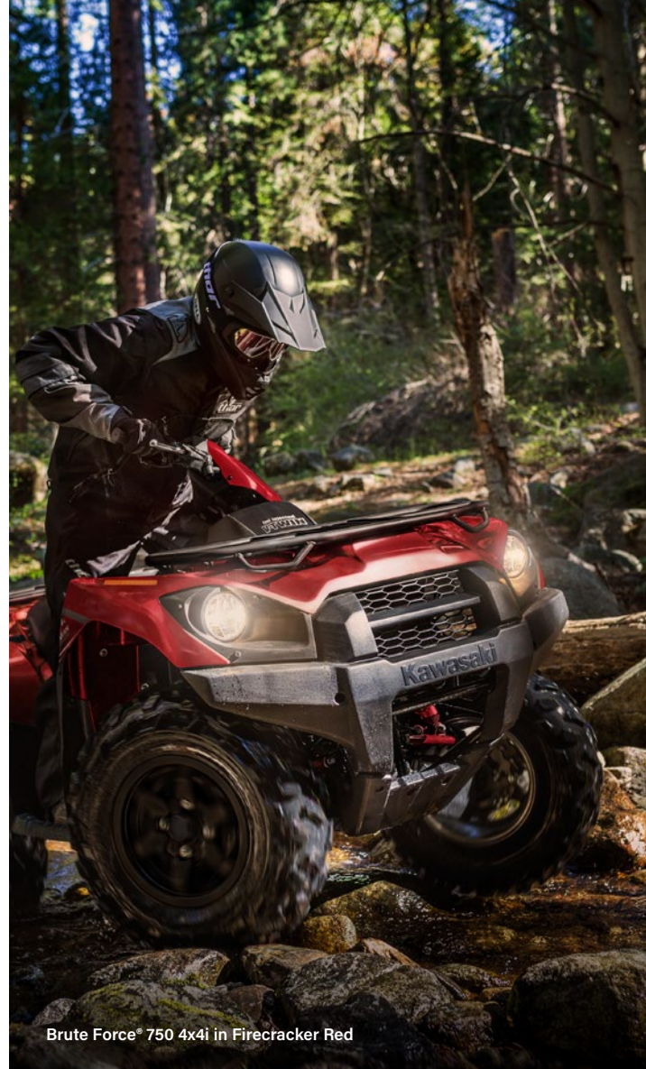
Brute Force® 750 4x4i in Firecracker Red