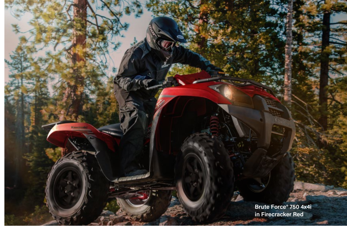
Brute Force® 750 4x4i in Firecracker Red