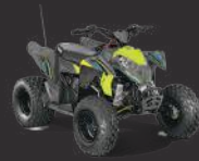
OUTLAW 110 EFI