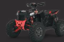
SPORTSMAN XP 1000 S