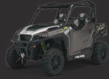
POLARIS GENERAL 1000 PREMIUM