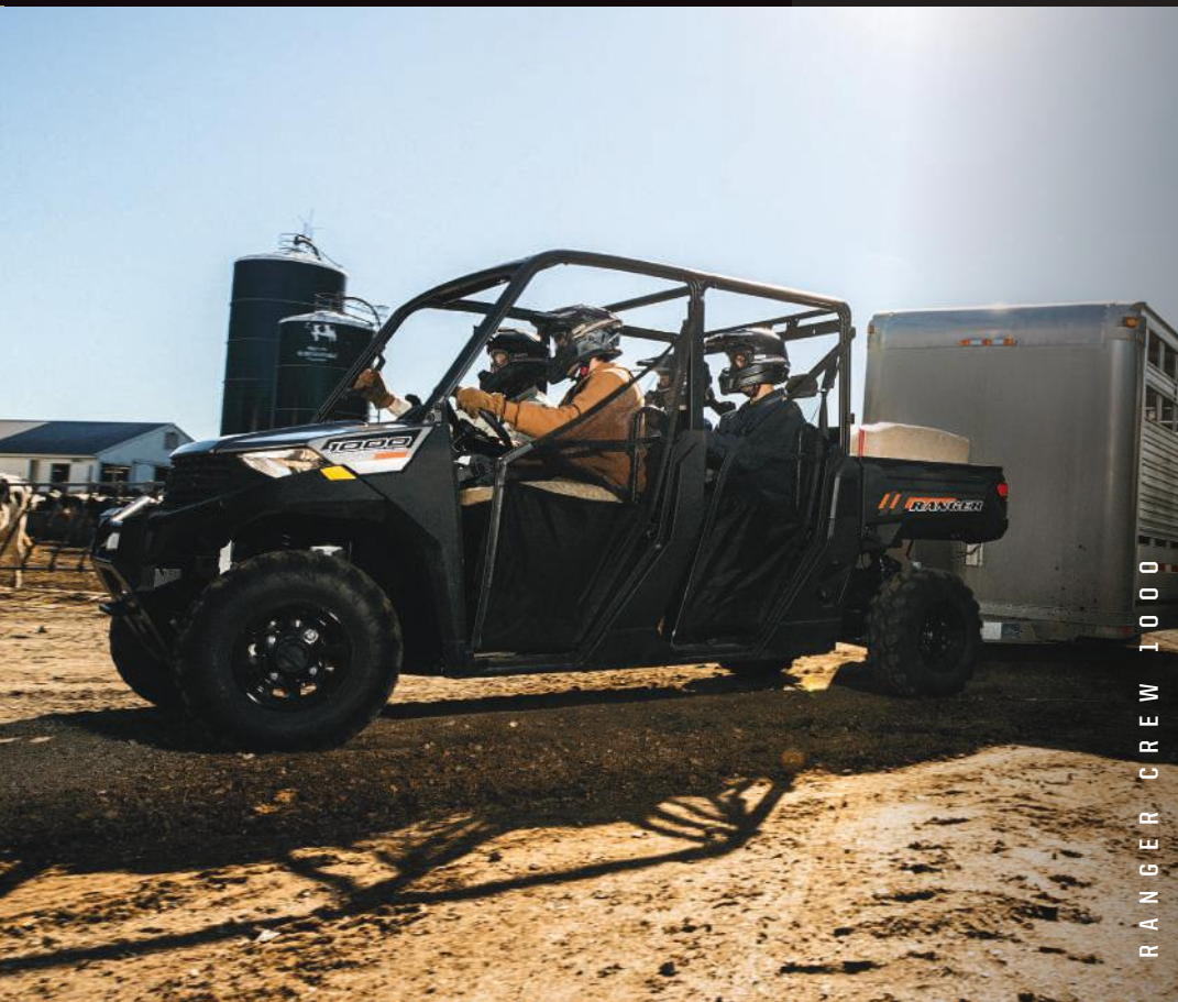
RANGER CREW 1000