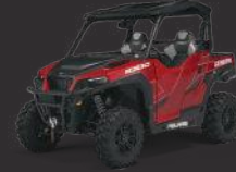
POLARIS GENERAL 1000 DELUXE