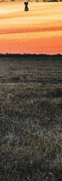
RANGER XP 1000 NORTHSTAR EDITION