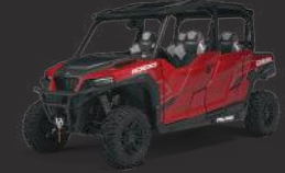
POLARIS GENERAL 4 1000 DELUXE