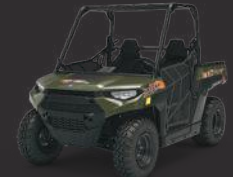
RANGER 150 EFI