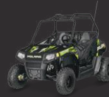
RZR 170 EFI