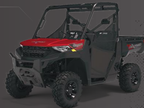
MODEL SHOWN: RANGER 1000