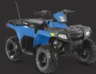
SPORTSMAN 110 EFI