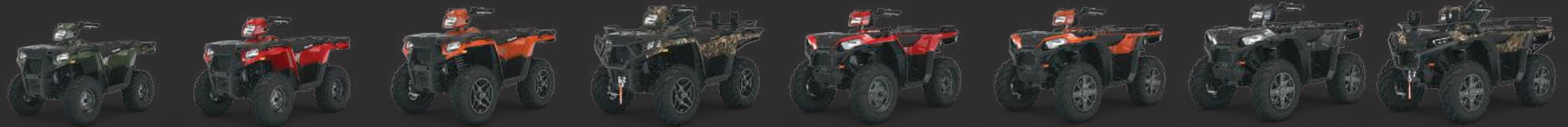
SPORTSMAN 450 H.O. AVAILABLE EPS