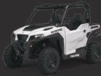
POLARIS GENERAL 1000