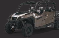
POLARIS GENERAL 4 1000