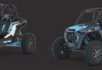
RZR PRO XP