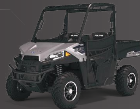
MODEL SHOWN: RANGER 570