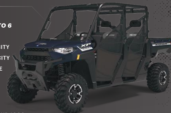
MODEL SHOWN: RANGER CREW XP 1000