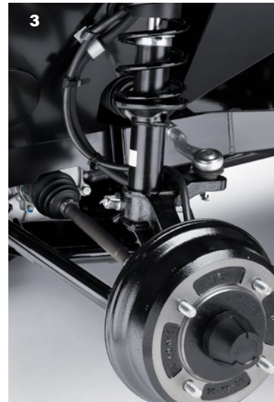
1. Fuel-injected V-twin Engine 2. 2WD/4WD and Dual-mode Rear Differential 3. MacPherson Strut-Type Front Suspension