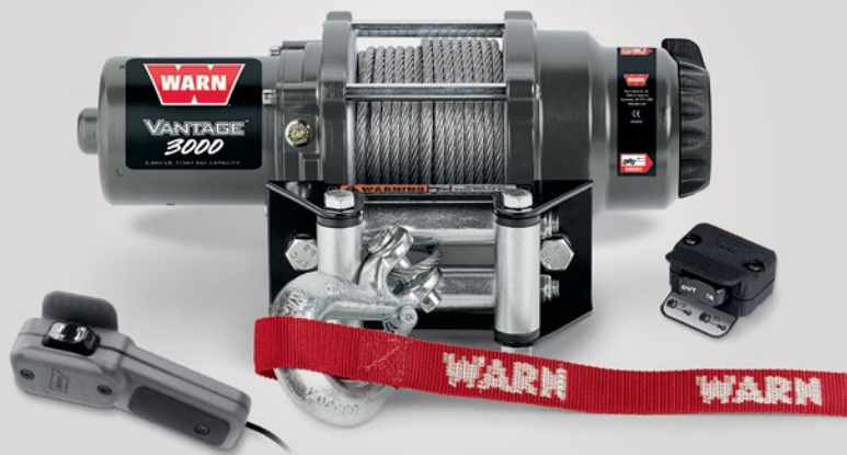
WARN® VANTAGE™ 3000 WINCH