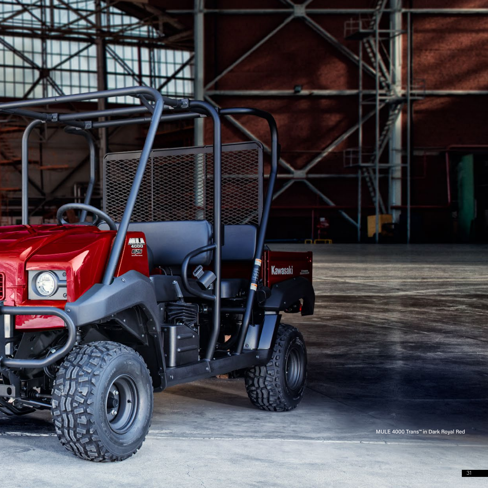
MULE 4000 Trans™ in Dark Royal Red