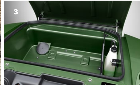
1. Versatile 2- to 4-passenger Trans Cab™ System 2. 2-inch Receiver Hitch 3. Generous 15.8-gallon Storage Space