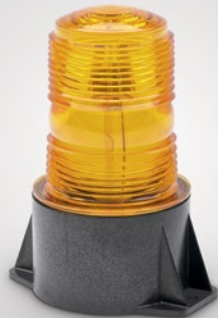
BEACON STROBE LIGHT