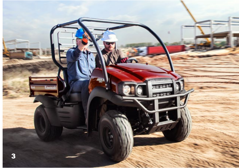
1. 401cc 4-stroke Engine 2. Tilting Cargo Bed 3. Compact Size