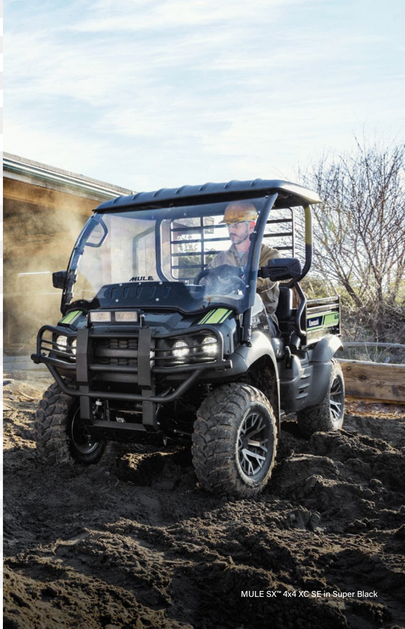
MULE SX™ 4x4 XC SE in Super Black

**Curb weight includes all necessary materials and fluids to operate correctly, full tank of fuel (more than 90 percent capacity) and tool kit (if supplied). Specifications subject to change.