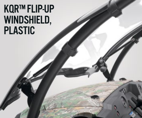
KQR™ FLIP-UP WINDSHIELD, PLASTIC