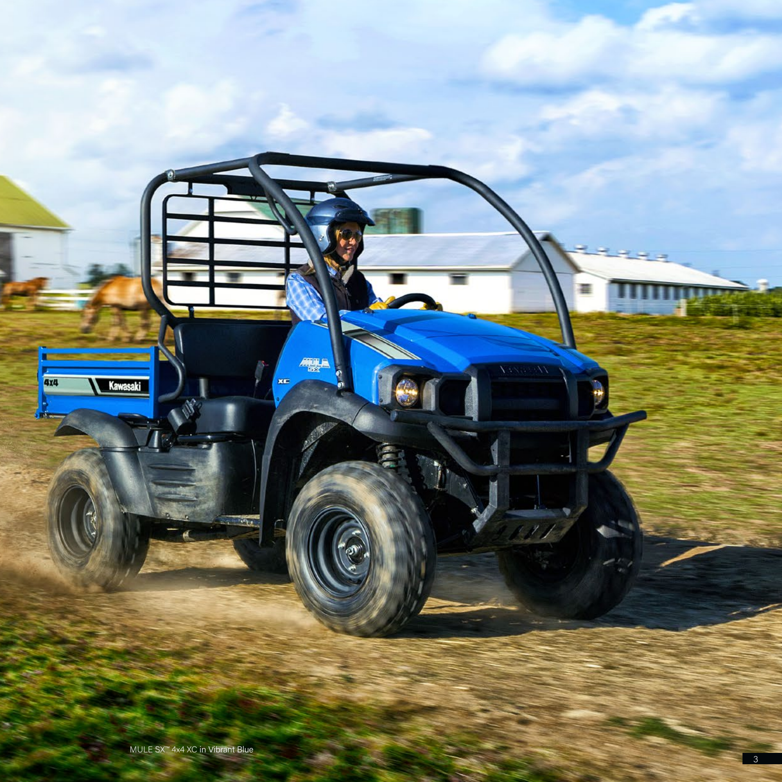
MULE SX™ 4x4 XC in Vibrant Blue