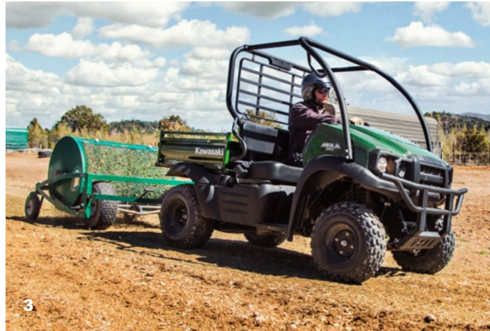
1. MULE SX 4x4 SE in Sunbeam Red* 2. MULE SX 4x4 in Timberline Green 3. MULE SX in Timberline Green