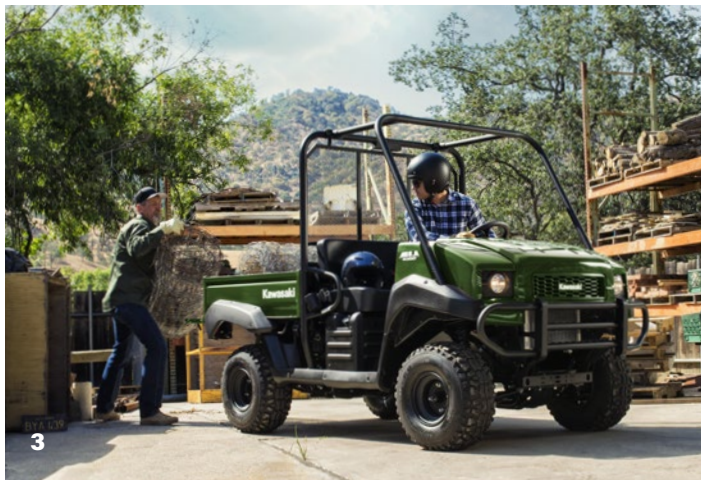
1. MULE 4010 4x4 SE in Super Black 2. MULE 4010 4x4 in Dark Royal Red 3. MULE 4000 in Timberline Green