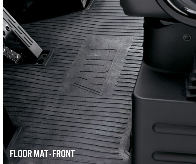
FLOOR MAT - FRONT