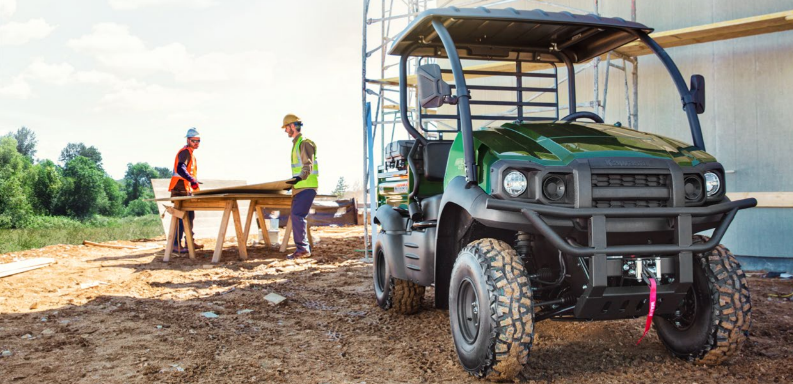
MULE SX 4x4 in Timberline Green Accessorized unit shown