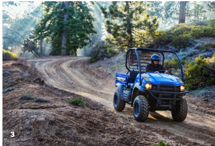
1. MULE SX 4x4 XC SE in Super Black* 2. MULE SX 4x4 XC Camo* 3. MULE SX 4x4 XC in Vibrant Blue