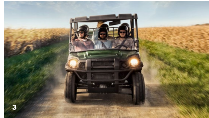
1. MULE PRO-FXT in Super Black* 2. MULE PRO-FXT Ranch Edition in Metallic Titanium 3. MULE PRO-FXT EPS in Timberline Green*

WARN® ProVantage™/Vantage™ — WARN®, the WARN logo and THE RED HOOK STRAP are registered trademarks of Warn Industries, Inc. ProVantage™ and Vantage™ are trademarks of Warn Industries, Inc. *Accessorized units shown