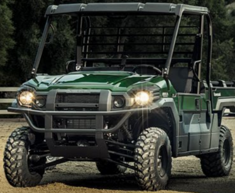
MULE PRO-DX™ EPS