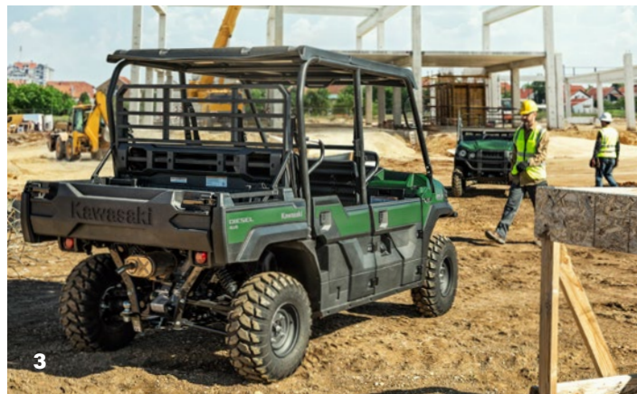
1. MULE PRO-DXT EPS in Timberline Green* 2. MULE PRO-DXT Trans Cab System* 3. MULE PRO-DXT EPS in Timberline Green*