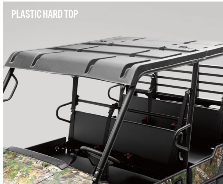
PLASTIC HARD TOP