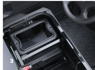
1. 2-toned Contour Bench Seat 2. 12-volt DC Power Outlets 3. Under-seat Storage Bin