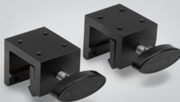
KQR™ ACCESSORIES MOUNT