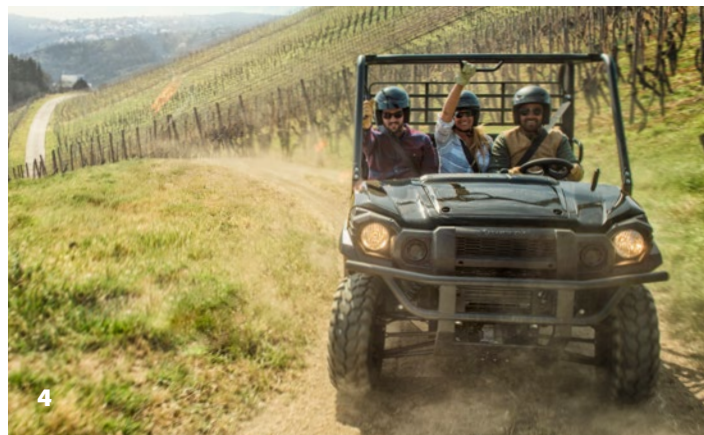
1. MULE PRO-FX EPS LE in Firecracker Red 2. MULE PRO-FX in Super Black 3. MULE PRO-FX EPS in Vibrant Blue* 4. MULE PRO-FX in Super Black