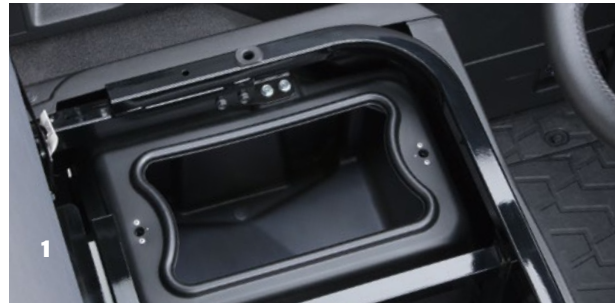
1. Under-seat Storage Bin 2. 12-volt DC Power Outlets 3. 996cc Diesel Engine

Rugged capability doesn't mean sacrificing comfort and convenience. Enjoy the spacious cabin of the MULE™ PRO Diesel side x sides. Thick cushioned bench seats add to the comfort of the MULE PRO Diesel Series by maximizing head-room, leg-room and forward visibility for all passengers. Retractable three-point seatbelts and grab handles help provide a secure ride for your crew, while 12-volt DC power outlets and an over 12-gallon under-seat storage bin are among the useful amenities.