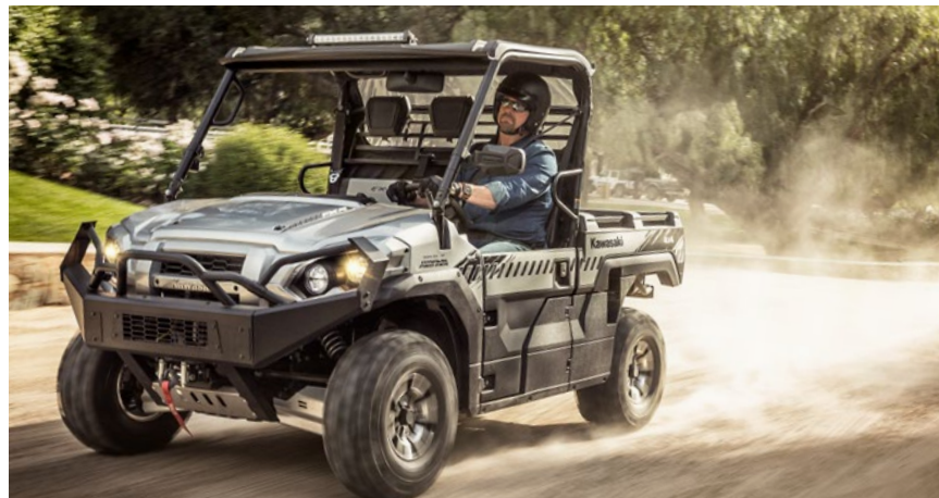
MULE PRO-FXR in Atomic Silver

Maintain a comfortable ride throughout the day with front and rear independent suspension equipped with large steel A-arms. The inline three-cylinder engine is extremely quiet with a refined high-quality sound so you can get from one point to another without loud sounds wearing you down. The premium two-tone contoured bench seats up to three adults comfortably and lends to the sporty appearance while also adding comfortable support for you and your passengers.