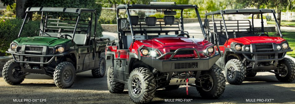
MULE PRO-DX™ EPS