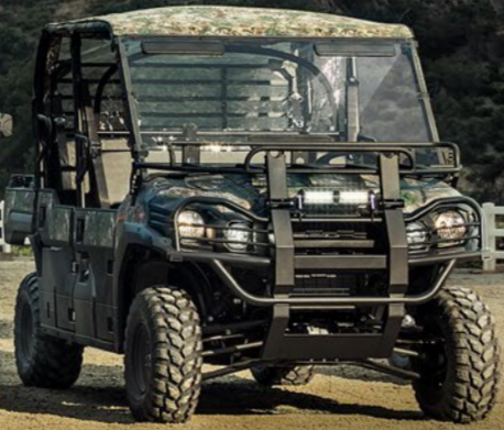
MULE PRO-FXT™ CAMO