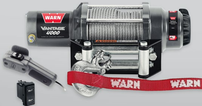
WARN® VANTAGE™ 4000 WINCH