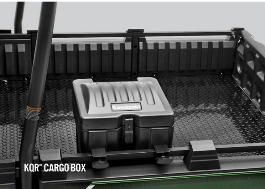
KQR™ CARGO BOX