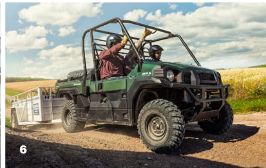
4. MULE PRO-FX™ in Super Black 5. MULE PRO-DXT™ EPS in Timberline Green 6. MULE PRO-DX™ EPS in Timberline Green