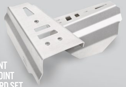
FRONT CV JOINT GUARD SET