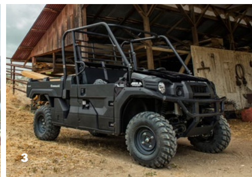
1. MULE PRO-FXR™ in Atomic Silver 2. MULE PRO-FXT™ EPS LE in Firecracker Red 3. MULE PRO-FX™ in Super Black