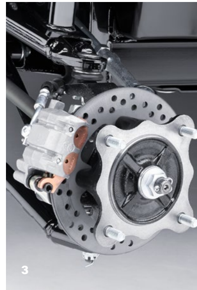
1. Cargo Bed 2. 2-inch Receiver Hitch 3. Front Brakes