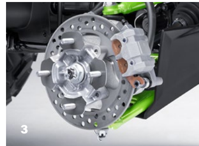
1. V-twin Engine 2. CVT & Drive 3. Front Disc Brakes