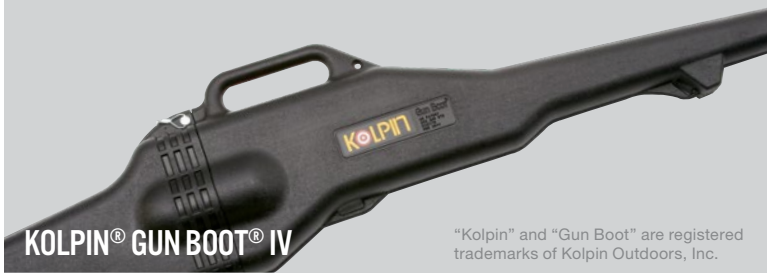
KOLPIN® GUN BOOT® IV

"Kolpin" and "Gun Boot" are registered trademarks of Kolpin Outdoors, Inc.