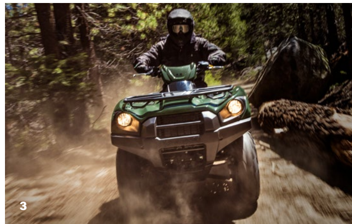
1. Brute Force 750 4x4i EPS in Super Black 2. Brute Force 750 4x4i EPS in Vibrant Blue 3. Brute Force 750 4x4i in Timberline Green