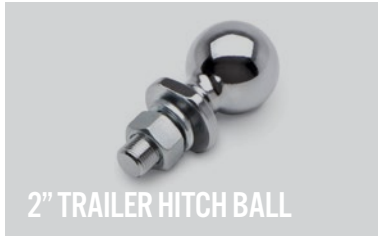
2" TRAILER HITCH BALL