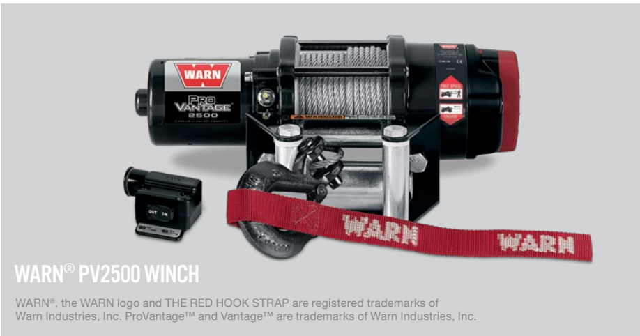
WARN® PV2500 WINCH

WARN®, the WARN logo and THE RED HOOK STRAP are registered trademarks of Warn Industries, Inc. ProVantage™ and Vantage™ are trademarks of Warn Industries, Inc.