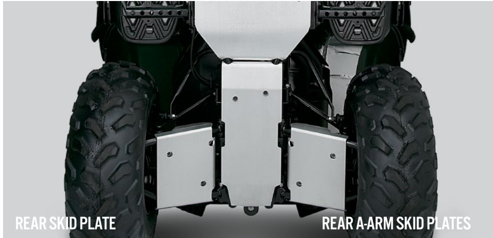
REAR SKID PLATE