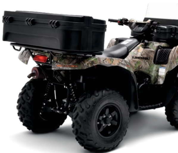
Accessorized unit shown

The durable double-cradle frame of the Brute Force® 750 4x4i ATVs is reinforced for added strength. Independent double wishbone front suspension, and double A-arms in the rear carry preload-adjustable shocks providing 6.7 inches of travel up front and 7.5 inches in the rear for a comfortable ride.