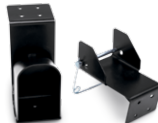
KQR™ GUN BOOT MOUNT