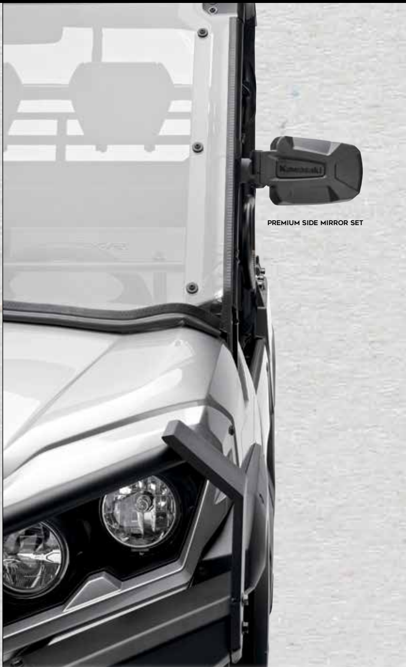
PREMIUM SIDE MIRROR SET