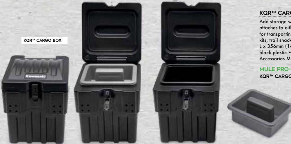
KQR™ CARGO BOX