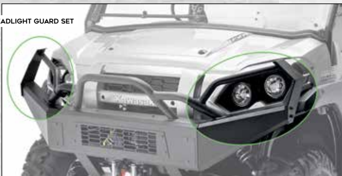
HEADLIGHT GUARD SET