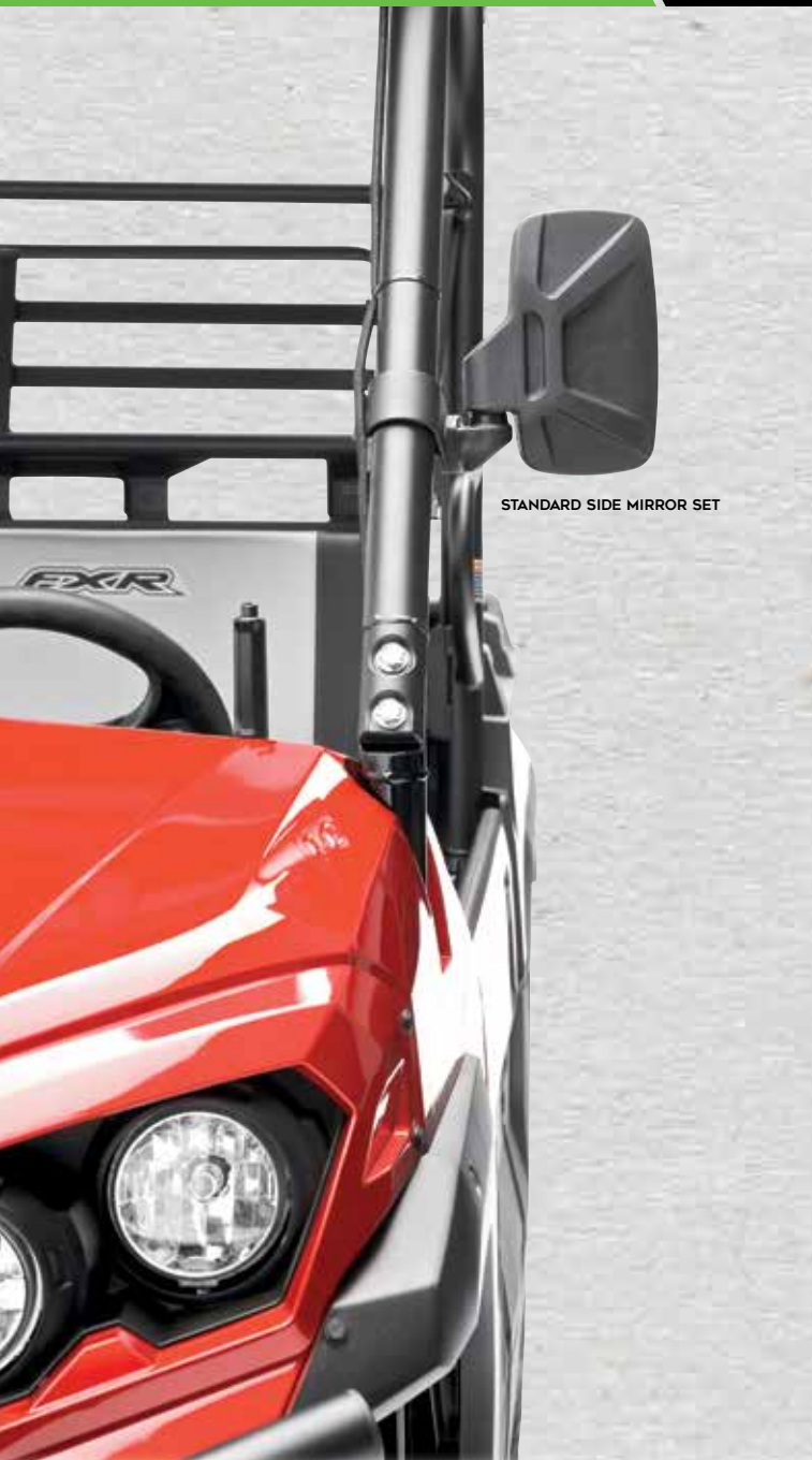
STANDARD SIDE MIRROR SET