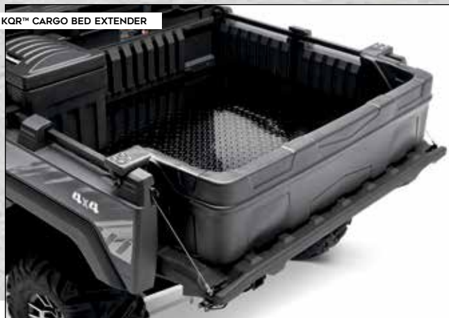
KQR™ CARGO BED EXTENDER

KQR™ CARGO BED EXTENDER ..... KAF080-022 ..... $184.95