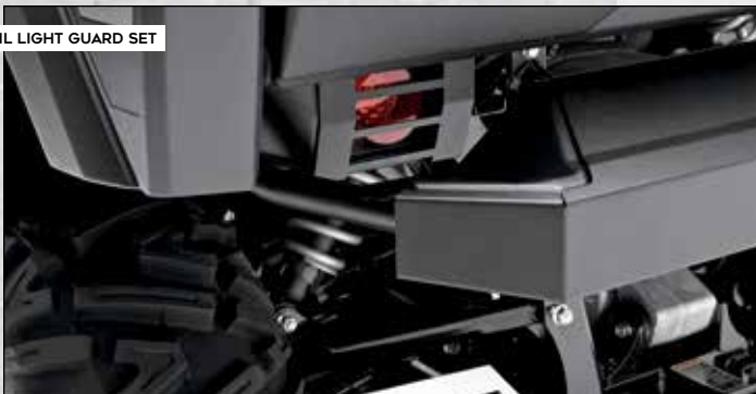
TAIL LIGHT GUARD SET

HEADLIGHT GUARD SET.....99994-1031.....$139.95