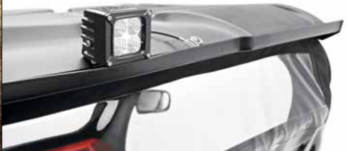
CARGO LIGHT / CARGO LIGHT HARNESS & BRACKET KIT