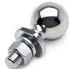
CHROME HITCH BALL