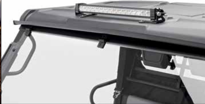
20" LED LIGHT BAR / LED LIGHT BAR HARNESS & BRACKET KIT