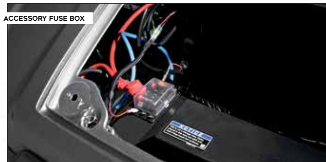
ACCESSORY FUSE BOX