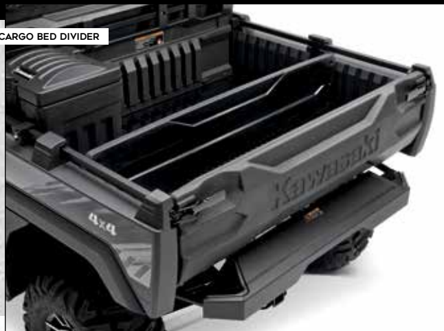
CARGO BED DIVIDER

CARGO BED MAT ..... 99997-0962 ..... $129.95 Available Fall 2017