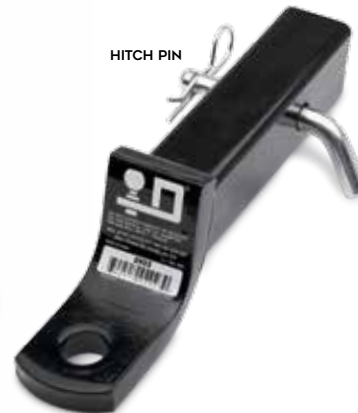
2' HITCH DRAWBAR, 4" DROP