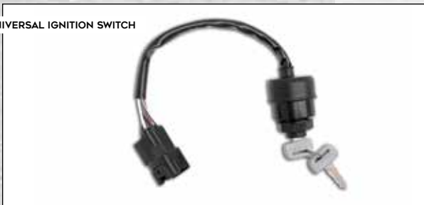
UNIVERSAL IGNITION SWITCH