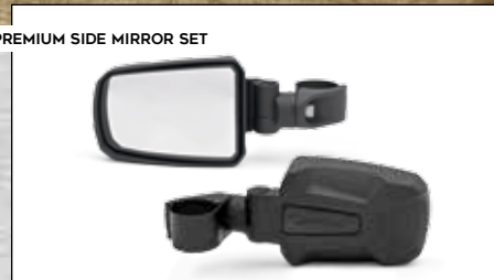
PREMIUM SIDE MIRROR SET

STANDARD SIDE MIRROR SET.....99994-0855.....$59.95