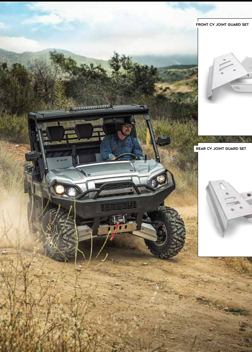
FRONT CV JOINT GUARD SET