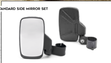
STANDARD SIDE MIRROR SET

REARVIEW MIRROR.....TX750-077.....$59.95