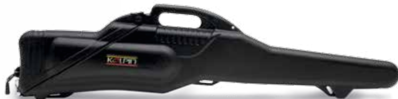
KOLPIN® GUN BOOT® 6.0 TRANSPORT