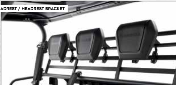
HEADREST / HEADREST BRACKET