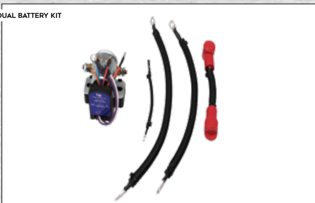
DUAL BATTERY KIT