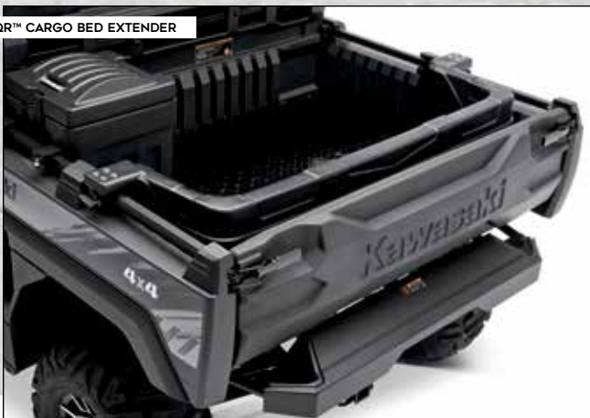
KQR™ CARGO BED EXTENDER

CARGO BED DIVIDER ..... KAF080-037 ..... $74.95