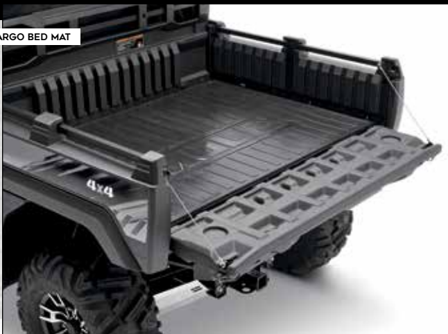
CARGO BED MAT