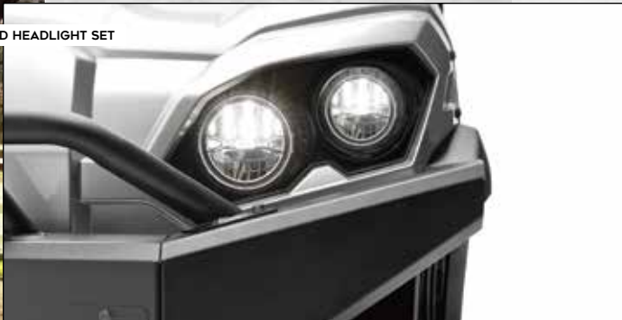
LED HEADLIGHT SET