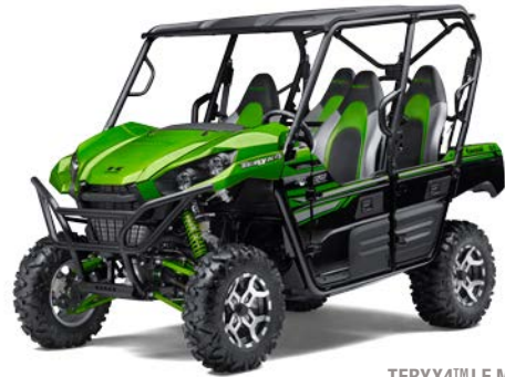
TERYX4™ LE MODEL SHOWN