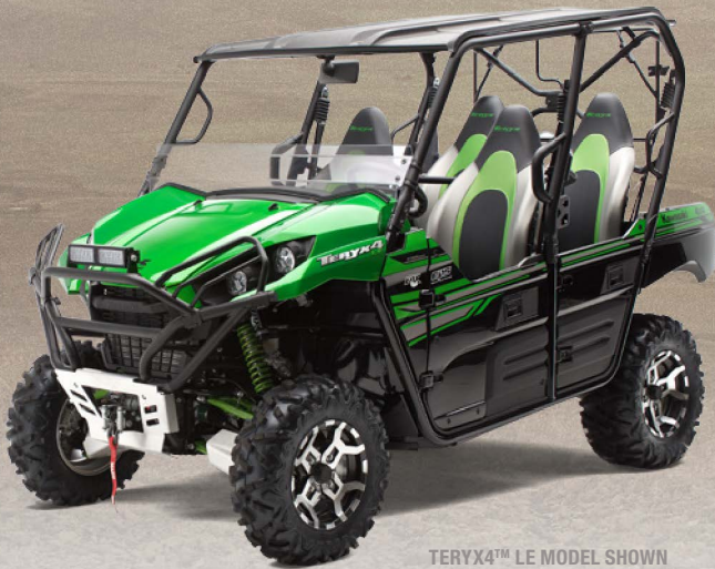
TERYX4™ LE MODEL SHOWN

Kawasaki is proud to offer a full line of accessories designed exclusively for your Teryx® and Teryx4™ side x side. Whether you're gearing up for mountains, hunting or trail riding, utility or fun, you can get the most out of your Teryx and Teryx4 with Kawasaki Genuine Accessories. Make it yours with any number of these strong, durable and versatile accessories or with a recommended accessory package.