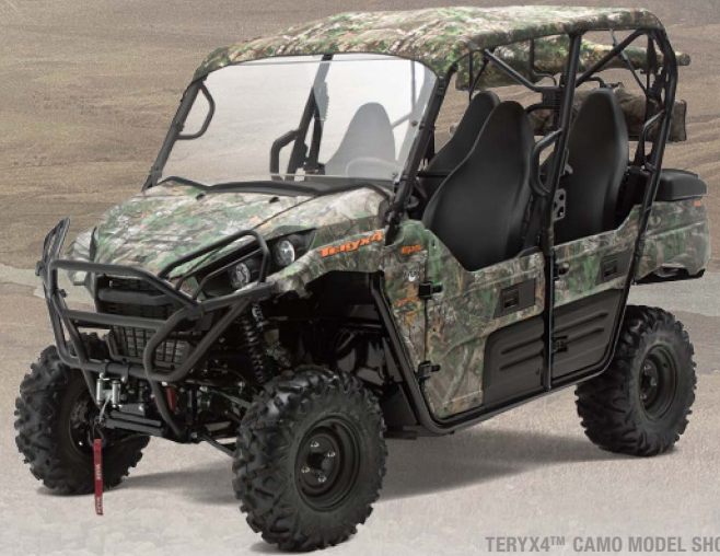
TERYX4™ CAMO MODEL SHOWN