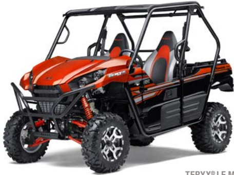
TERYX® LE MODEL SHOWN