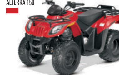
Minimum operator age: 14