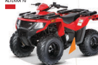
Minimum operator age: over 12