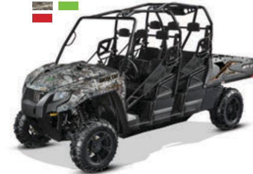
HDX 700 XT CREW

If you think the HDX is great, you'll love the HDX Crew — and so will five other people. The machine features all the goods of the HDX with two three-person contoured bench seats, making each venture comfortable for up to six adults.