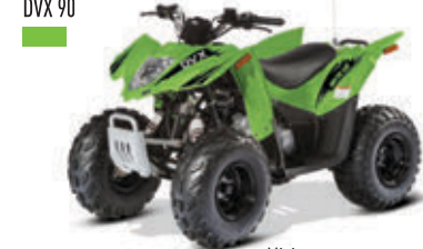
Minimum operator age: over 12