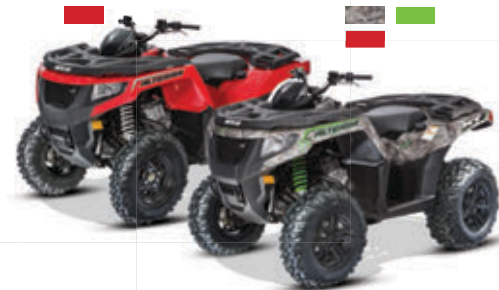
ALTEERRA 700 XT