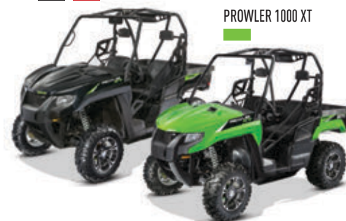
PROWLER 1000 XT